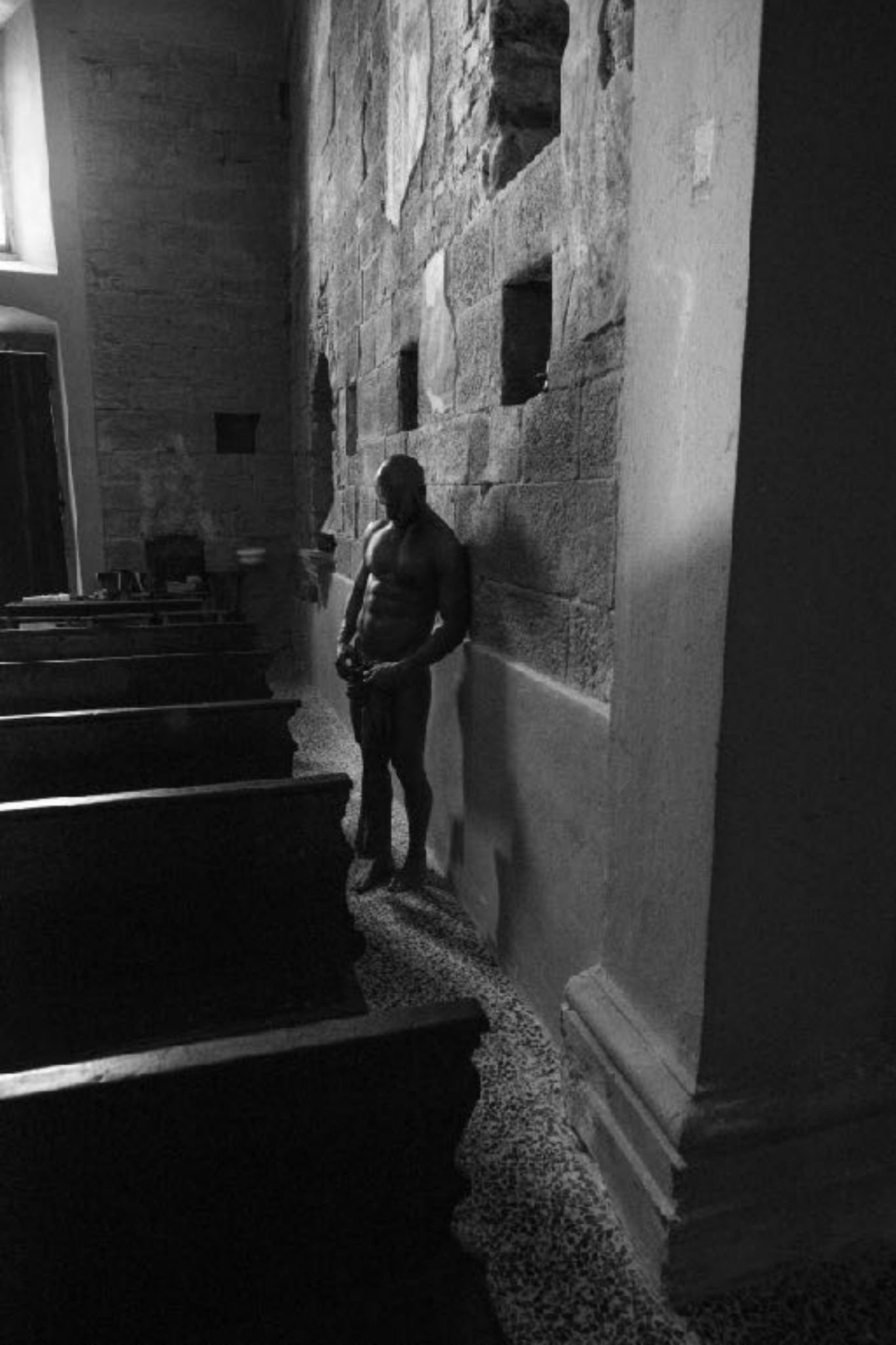
The church's twilight - IVM 4985