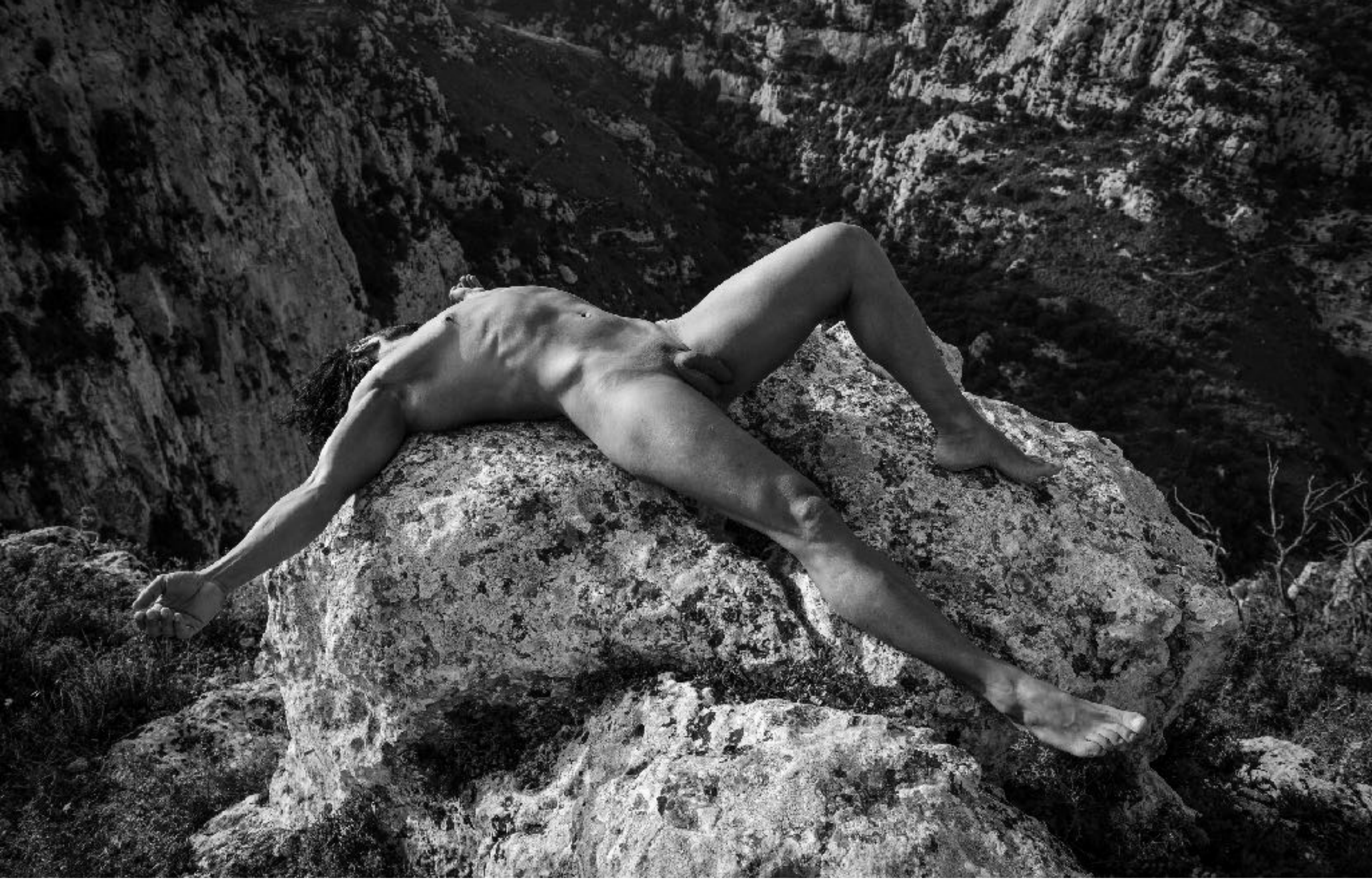
Sicilian naked - Iblei mountains - IVM 4269