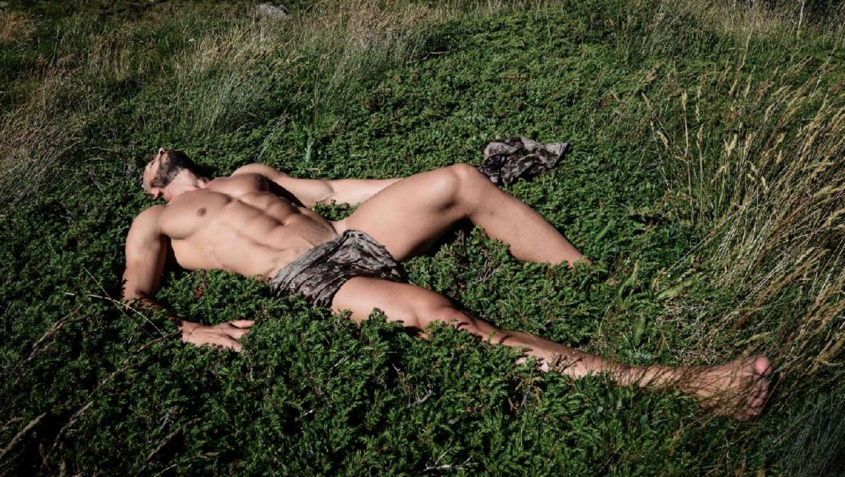
Man surrounded by plants and the sun - IVM 5014