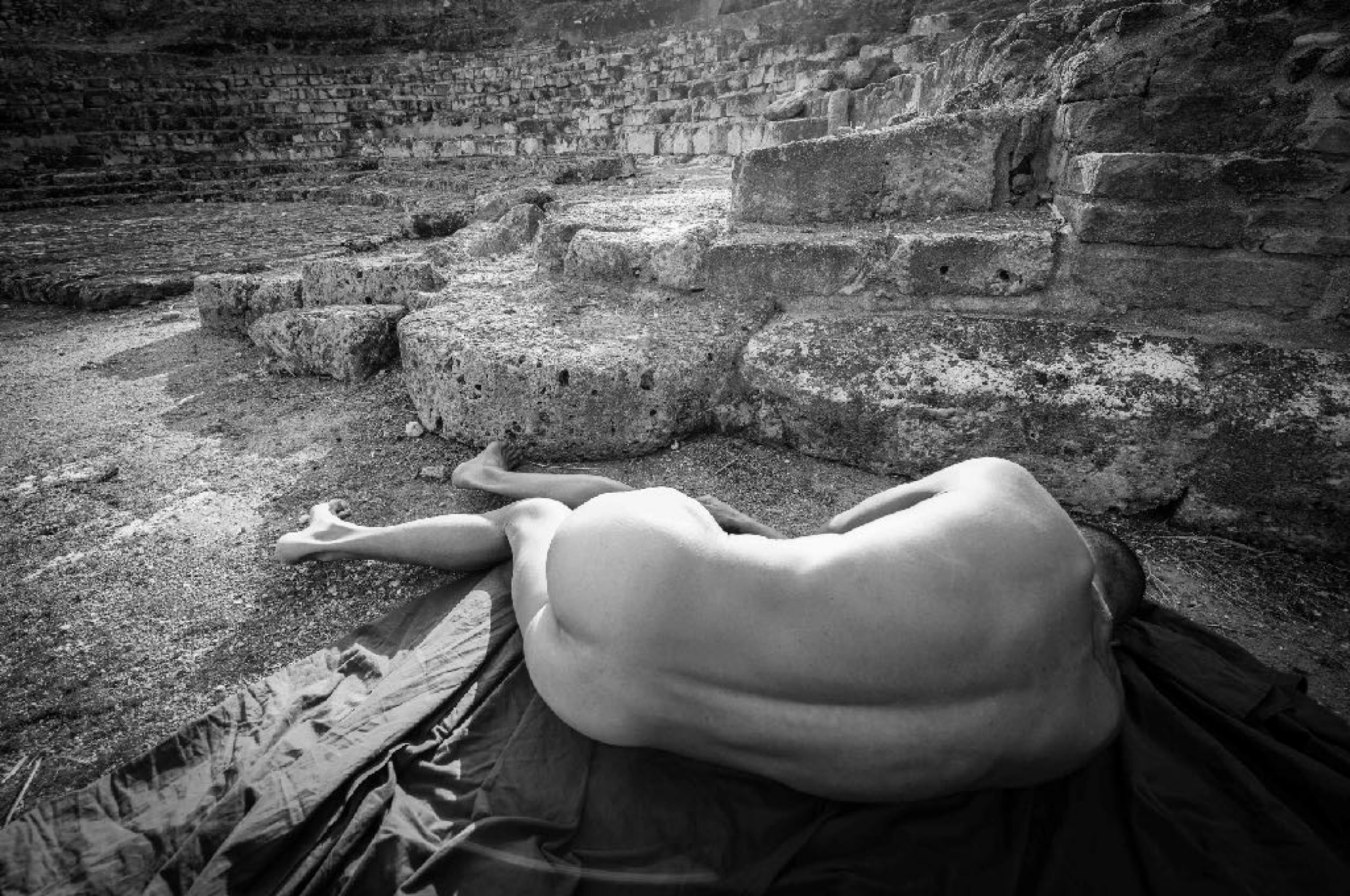
Alone - IVM 2265