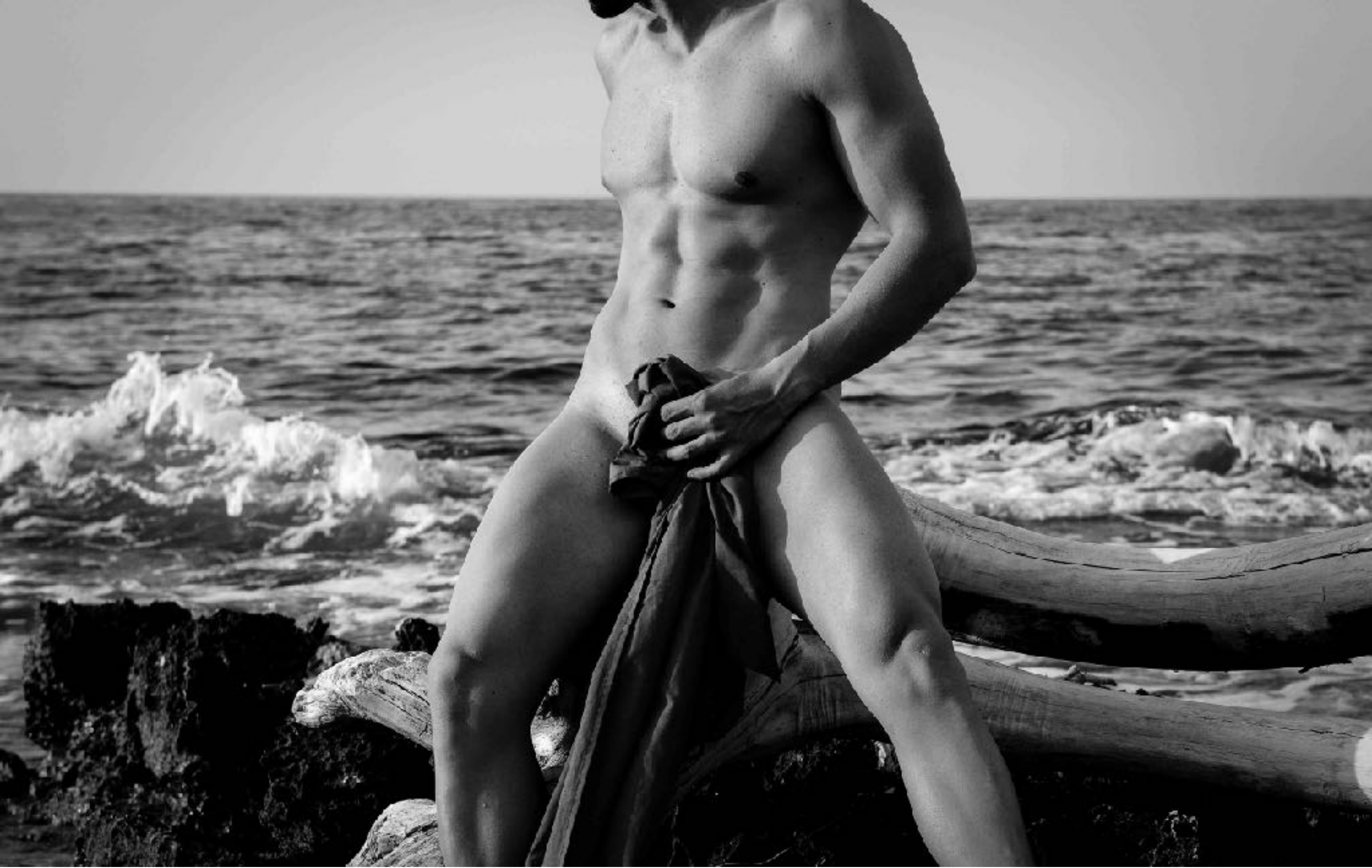
Naked looking at the sea - IVM 1618