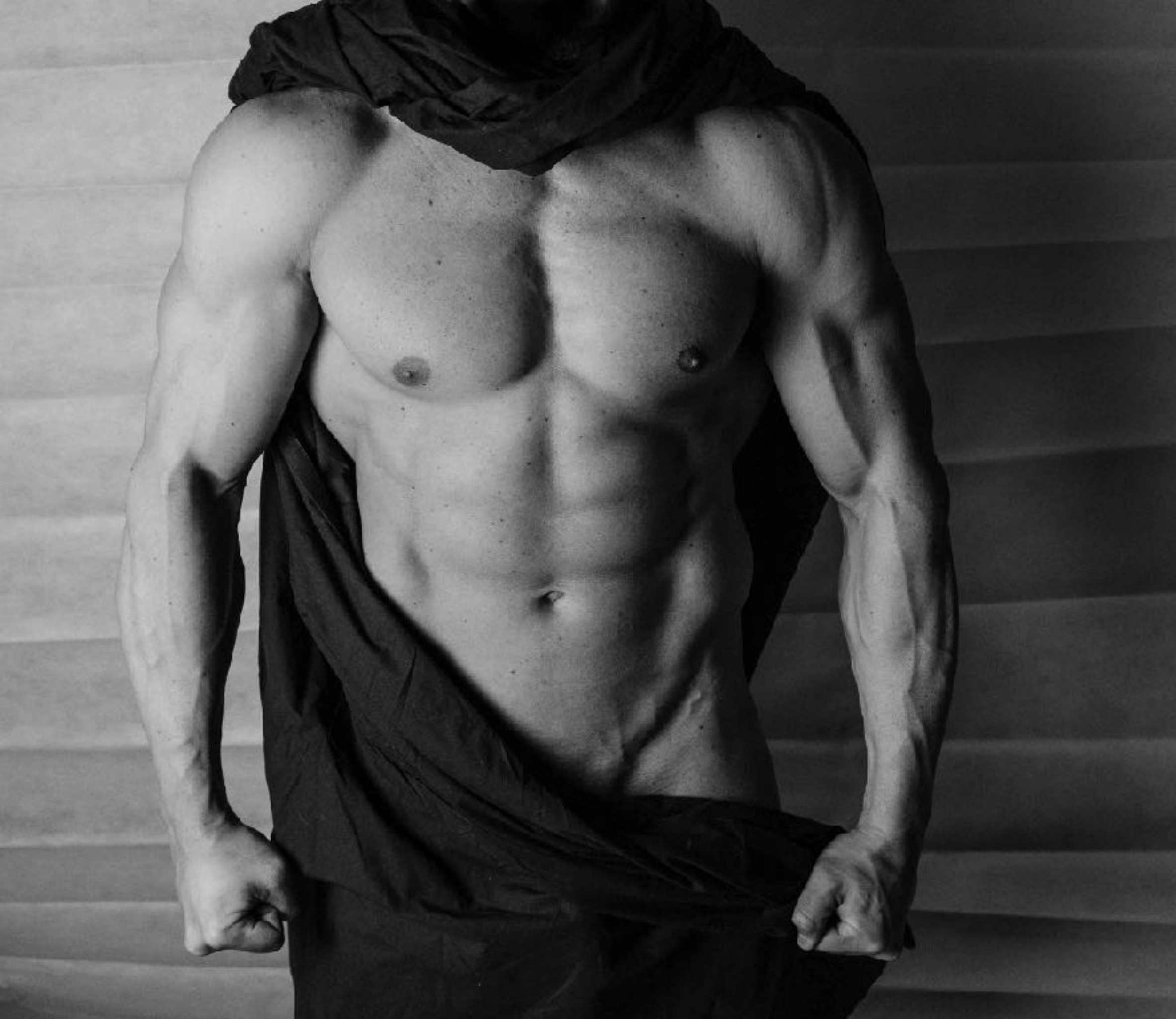
The warrior - IVM 3227