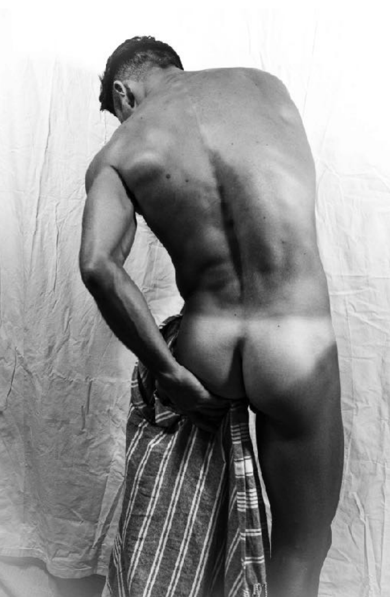
After the shower -IVM 5229