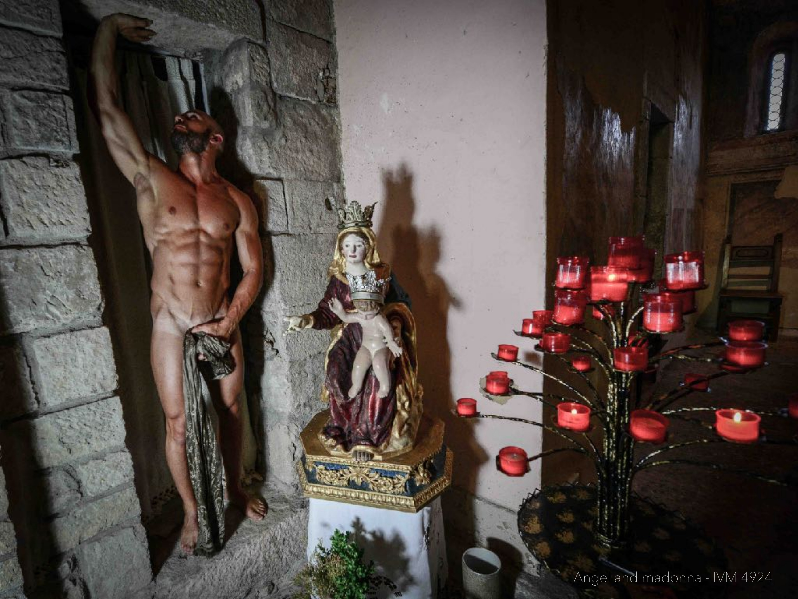
Angel and madonna - IVM 4924