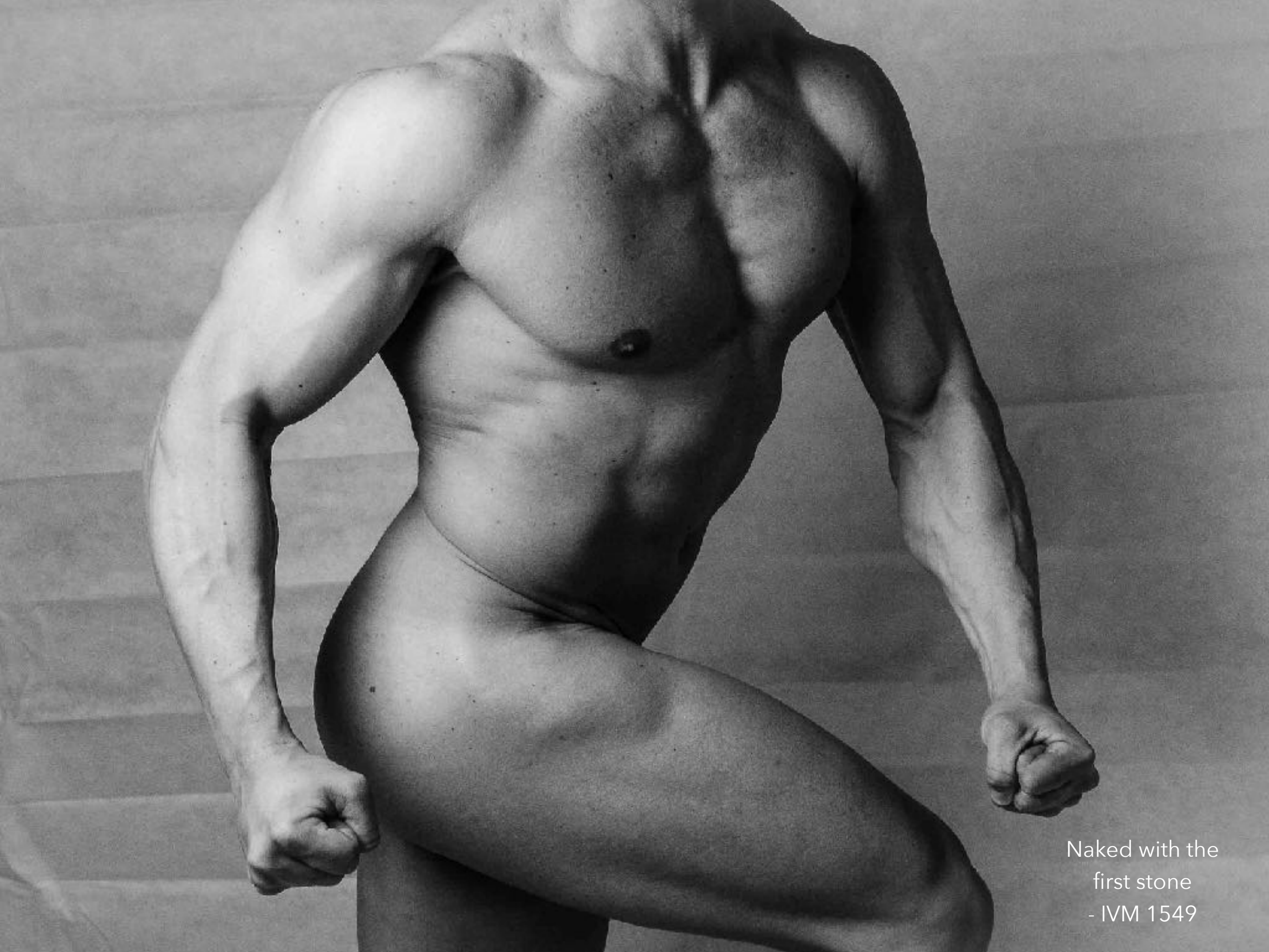
Naked with the first stone - IVM 1549