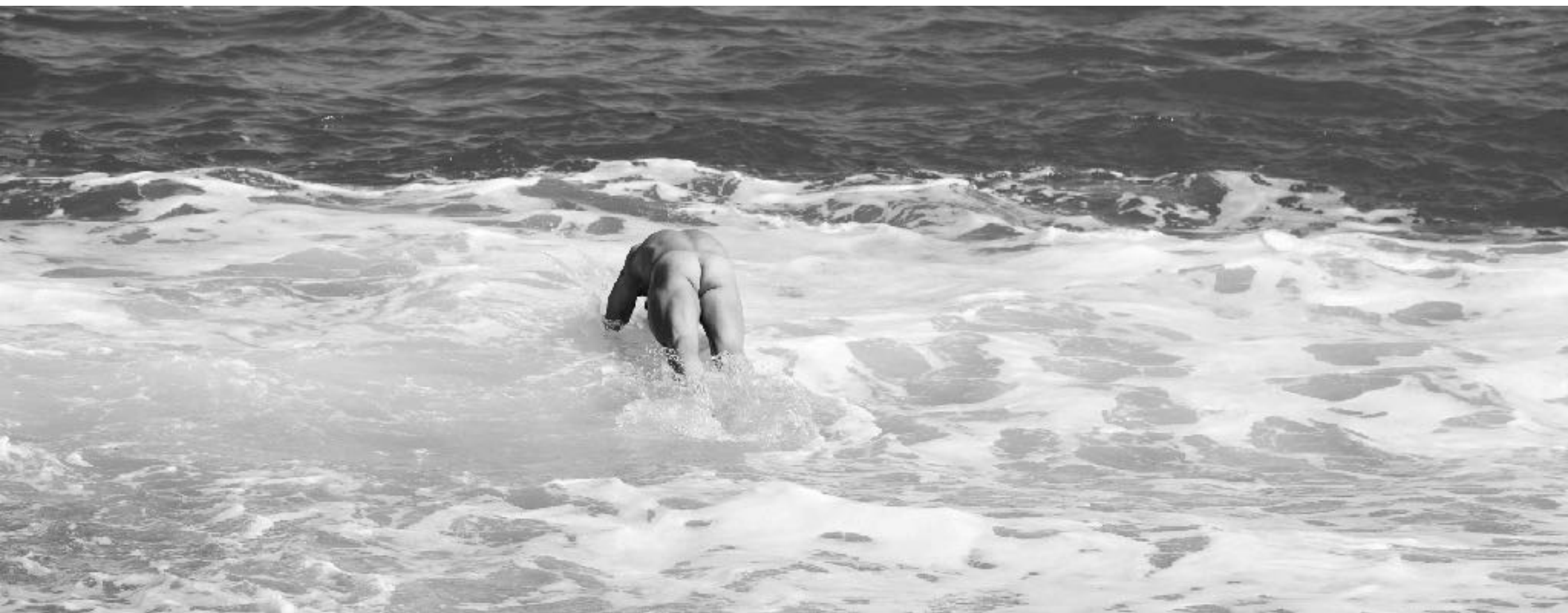
A naked man's dive - IVM 2092