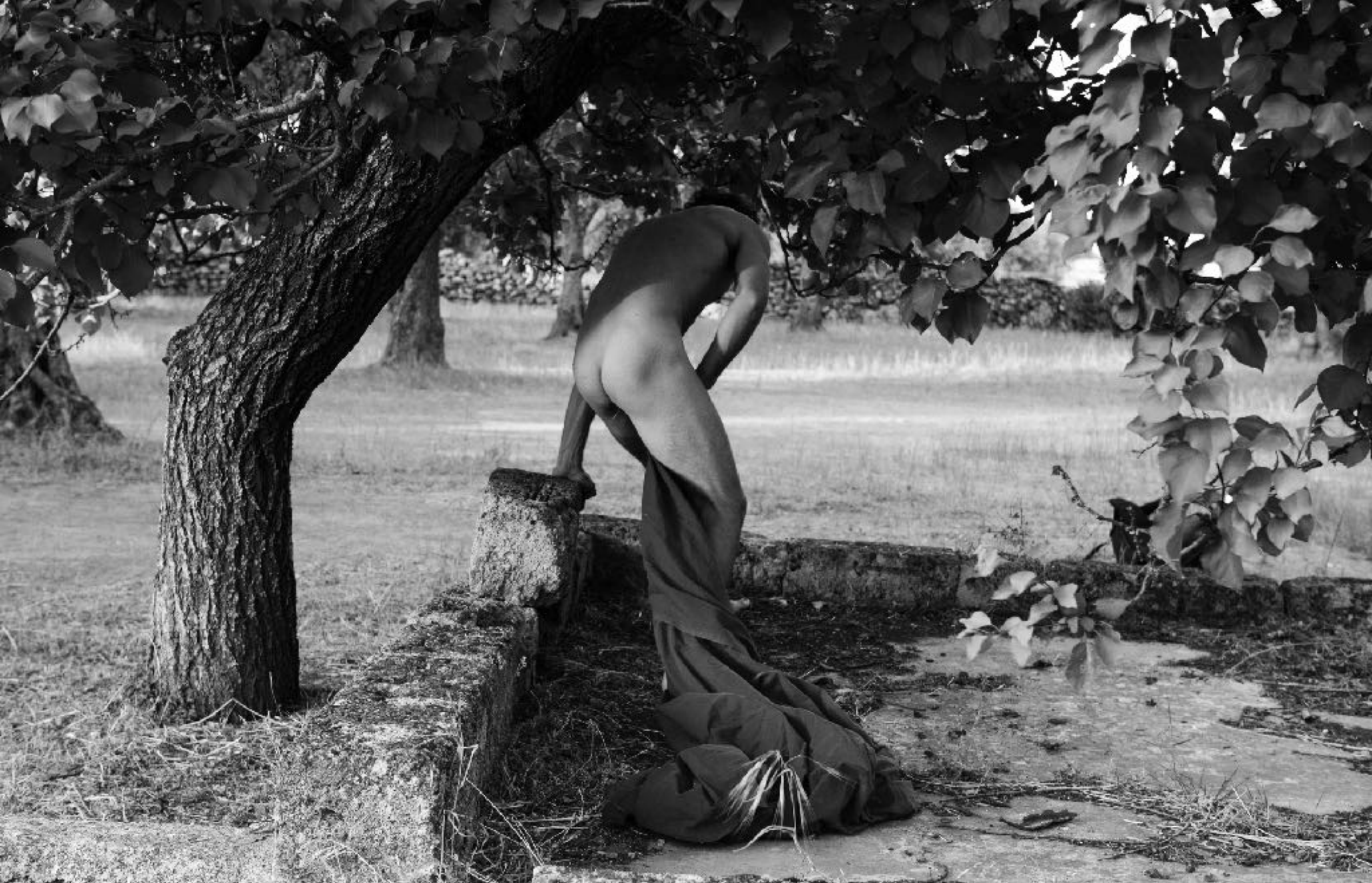
Looking for the cool -IVM1244