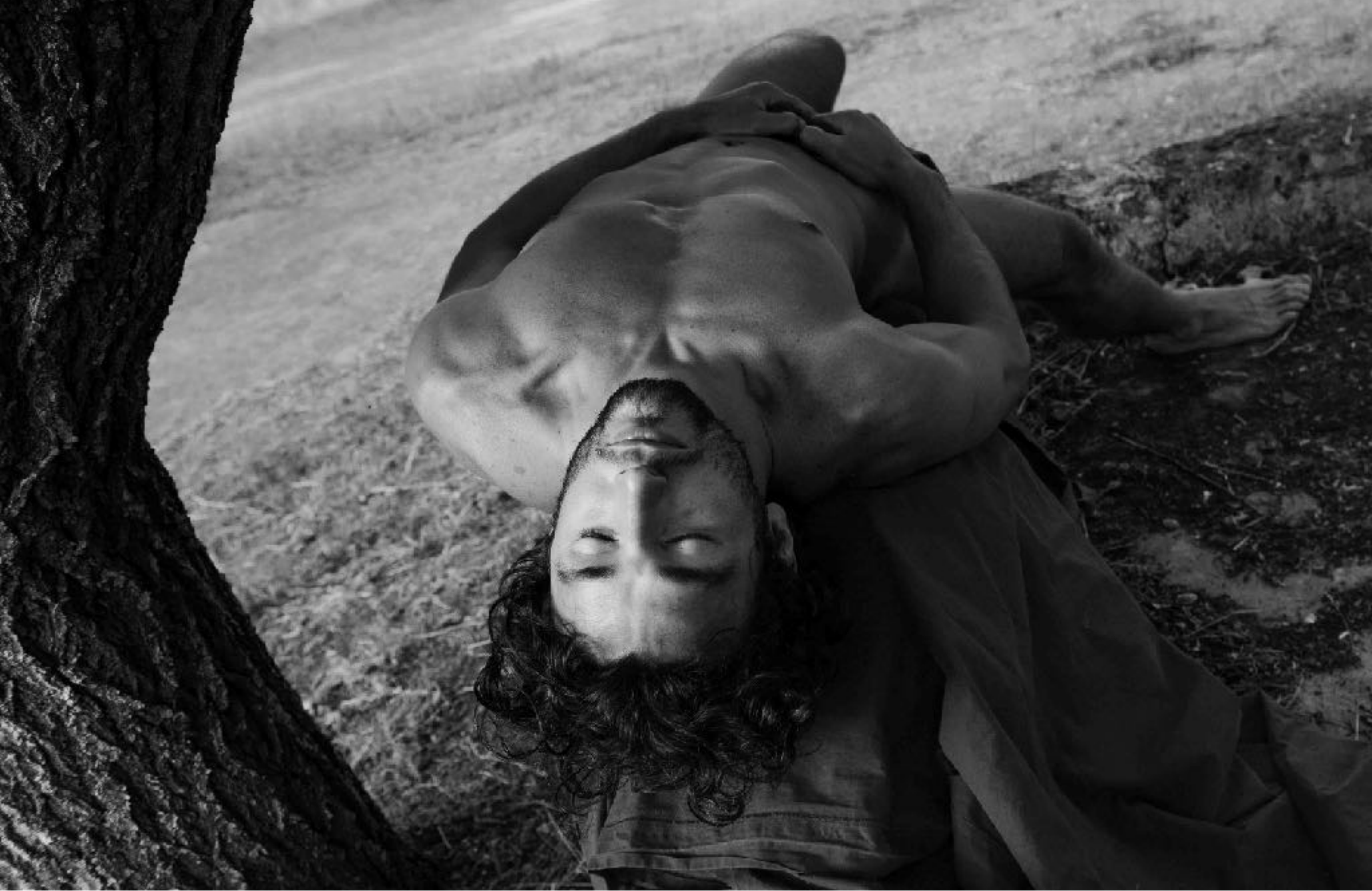
Man is relaxing under a tree - IVM 2151