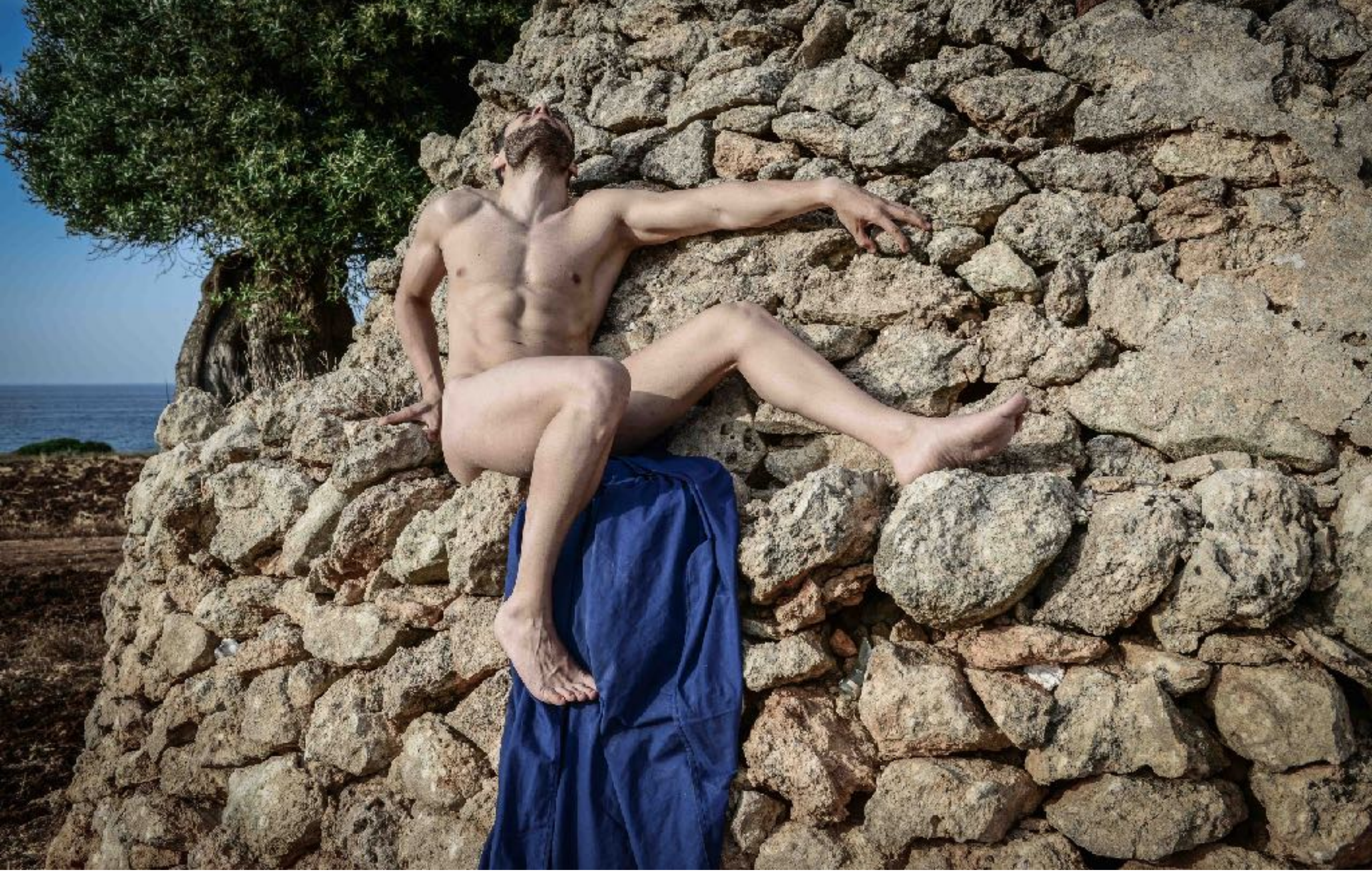
Naked on the Apulian trullo - IVM 1591