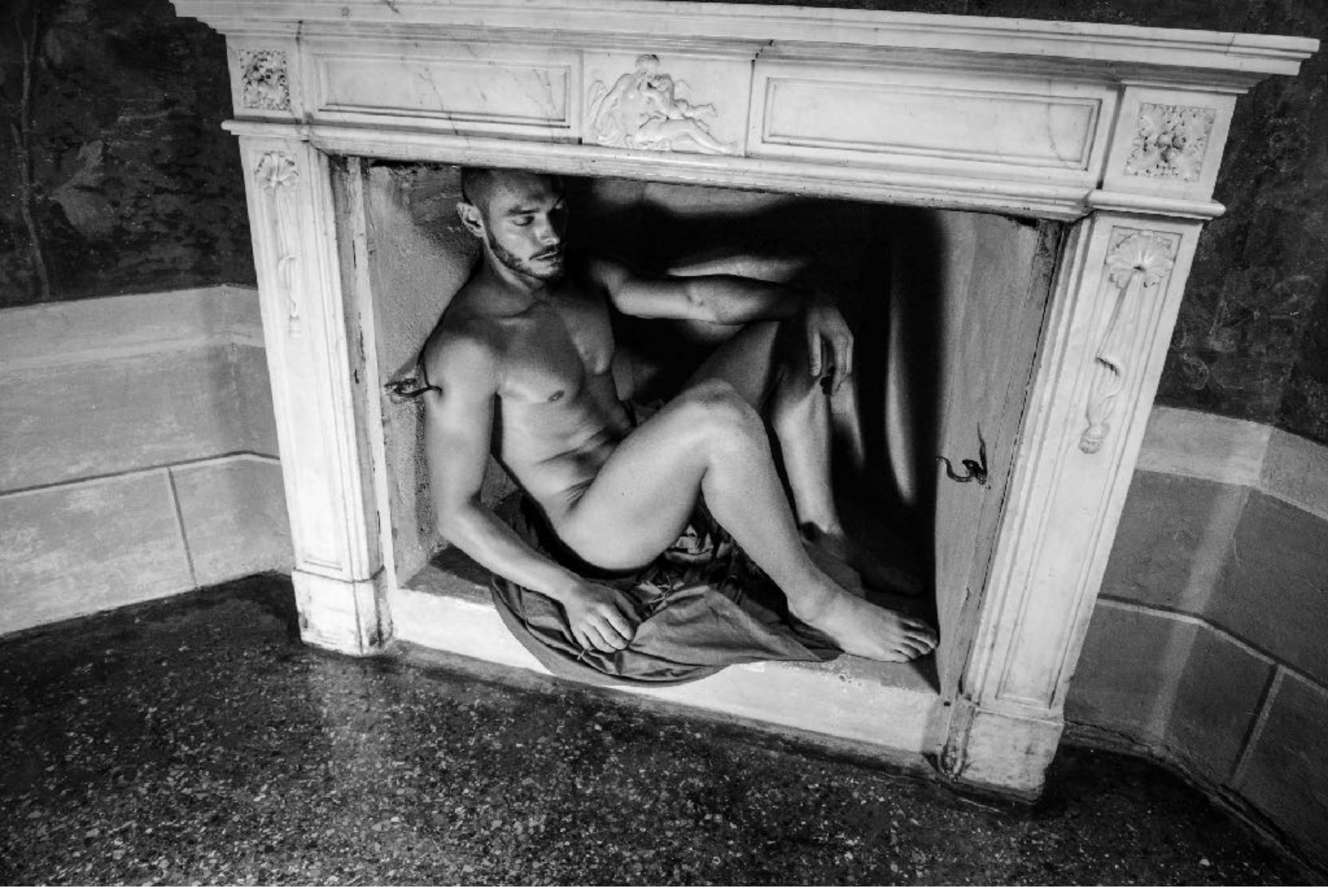
Man on the ancient fireplace - IVM 2453