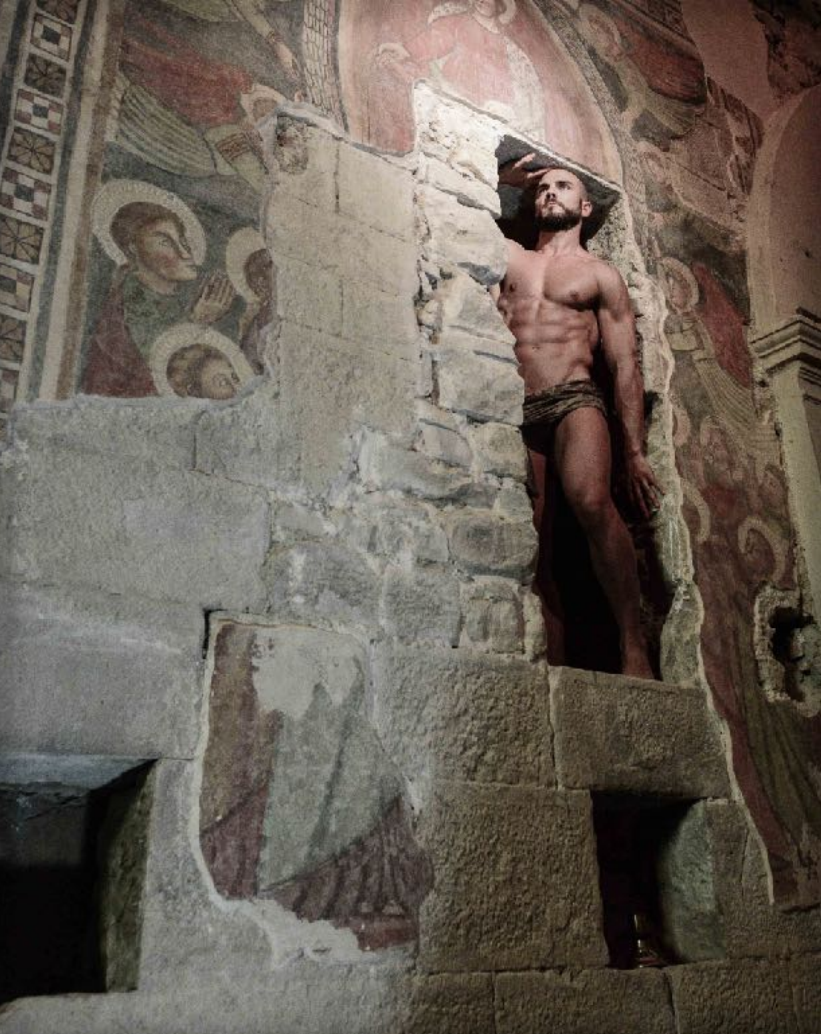
Inside a 15th century fresco - IVM 4948