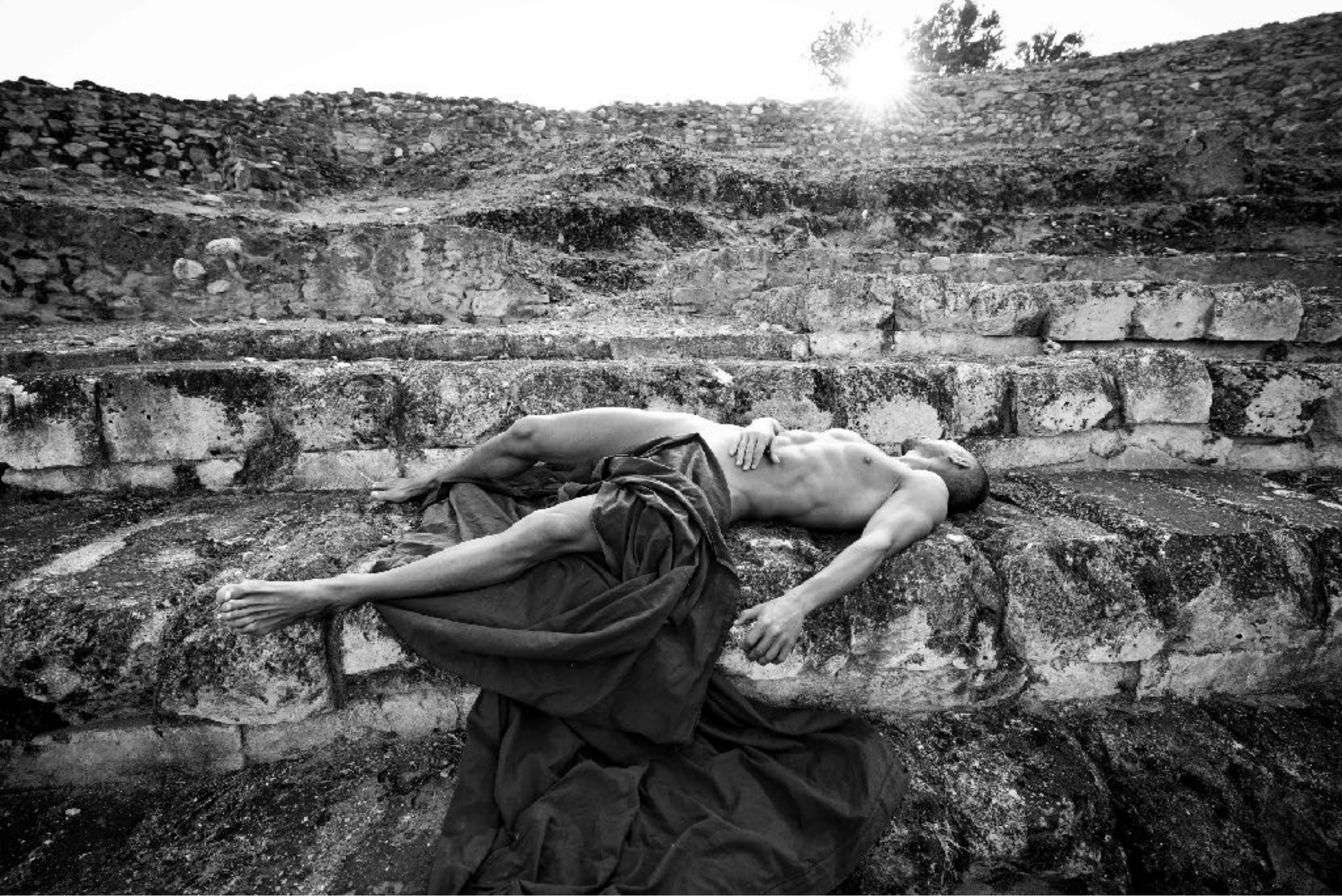
The ancient rest - IVM 2231