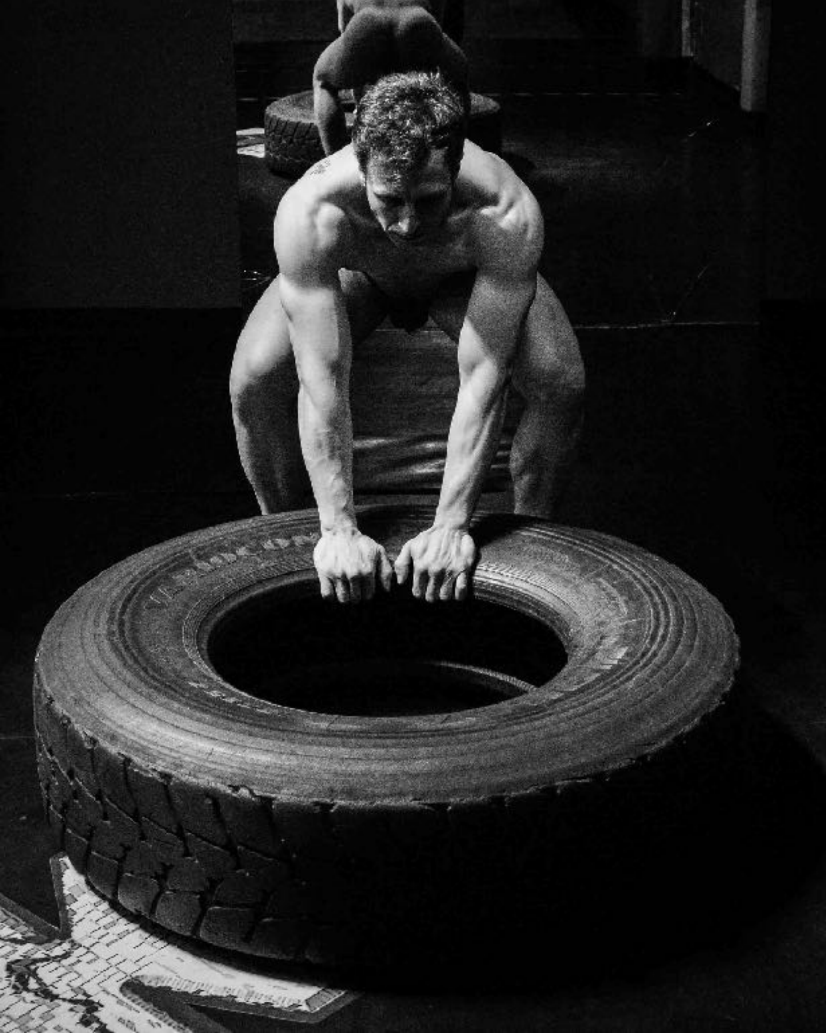
Workout whit the wheel - IVM 9799