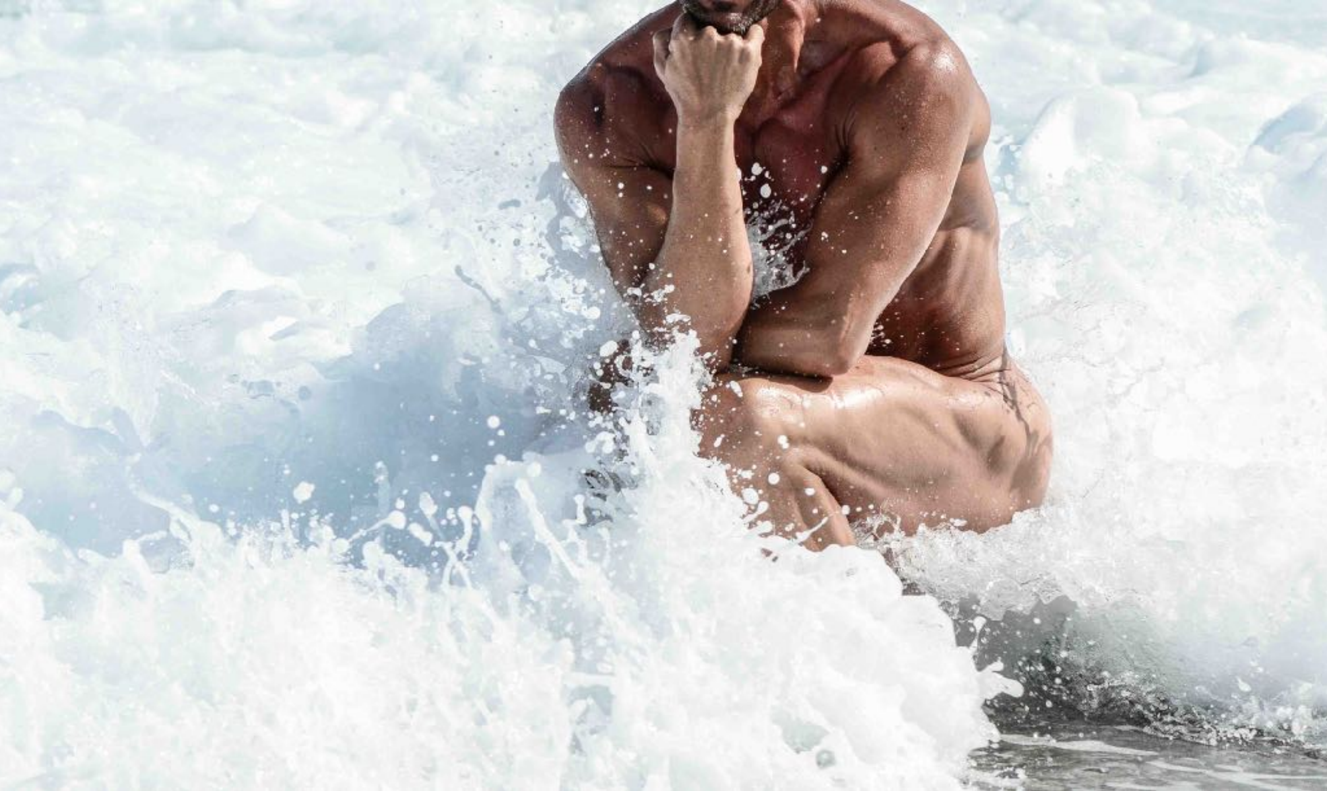
Naked man in the waves - IVM 2114