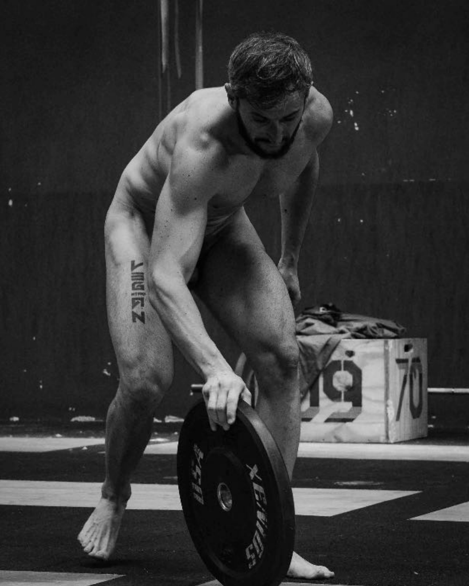
Man workout with weight - IVM 0394