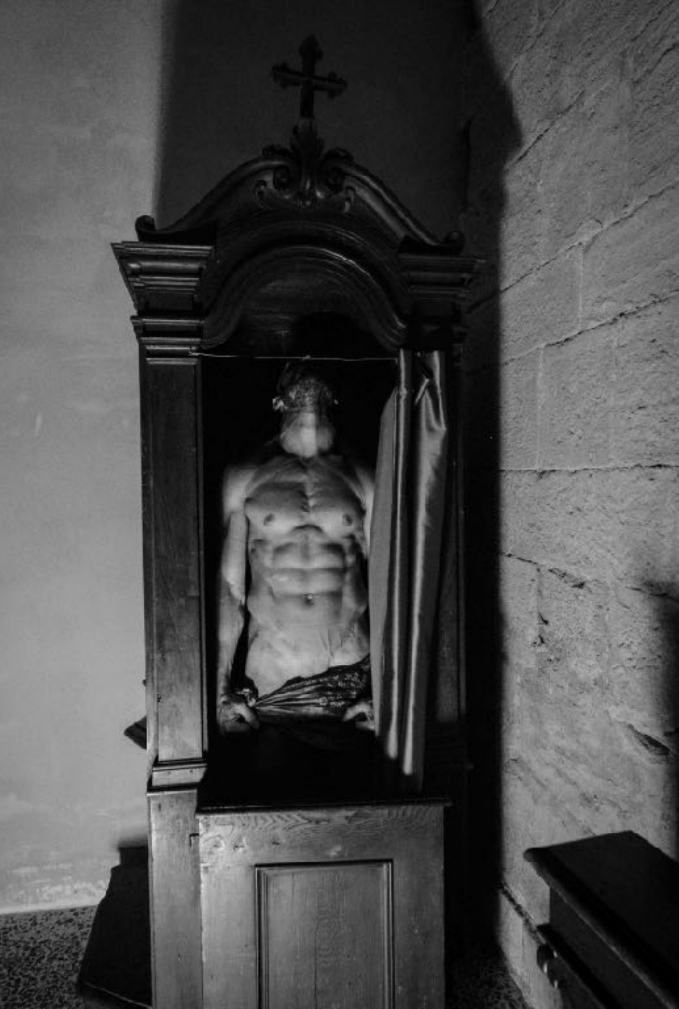
The liberation - IVM 4968