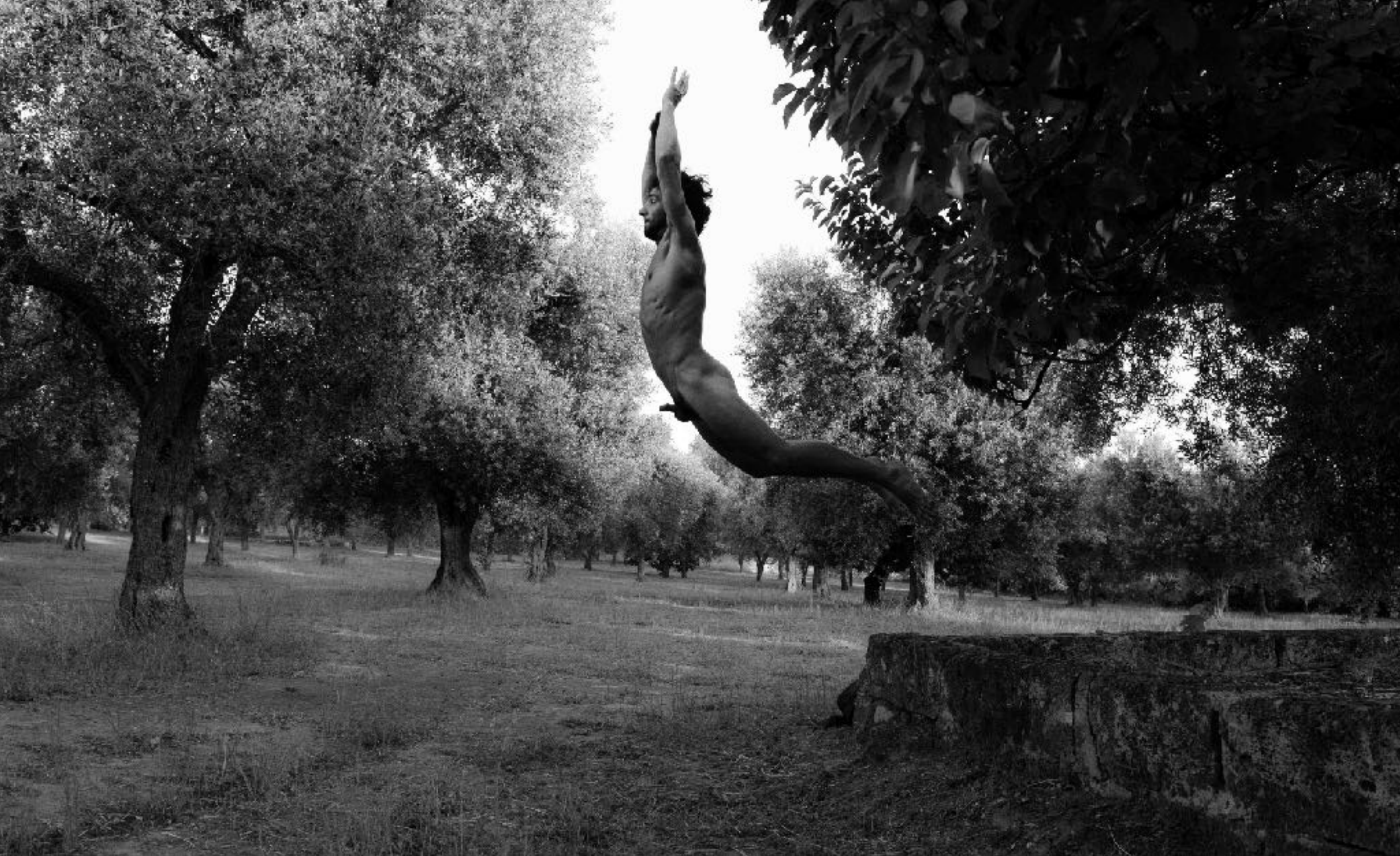
The jump among the olive trees - IVM 1262