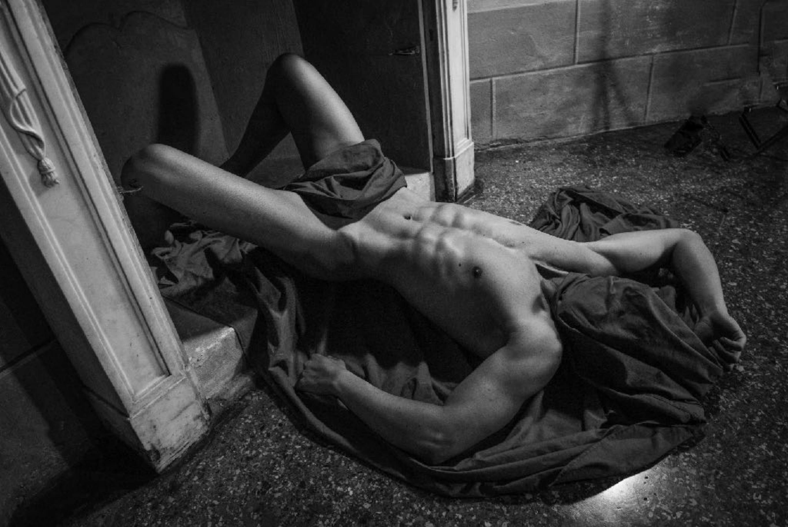
The fireplace - IVM 2468