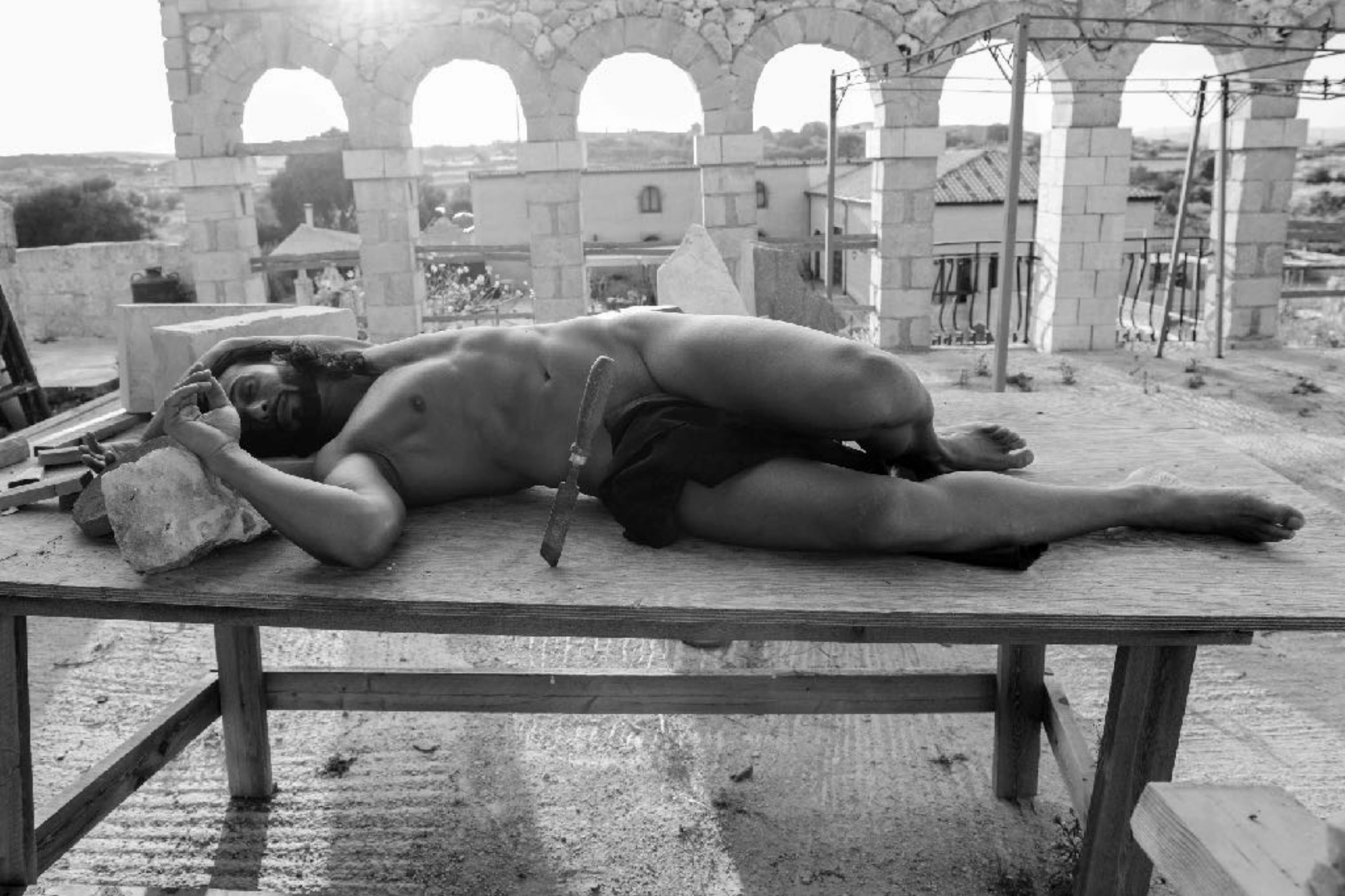
The sculptor's rest - IVM 4723