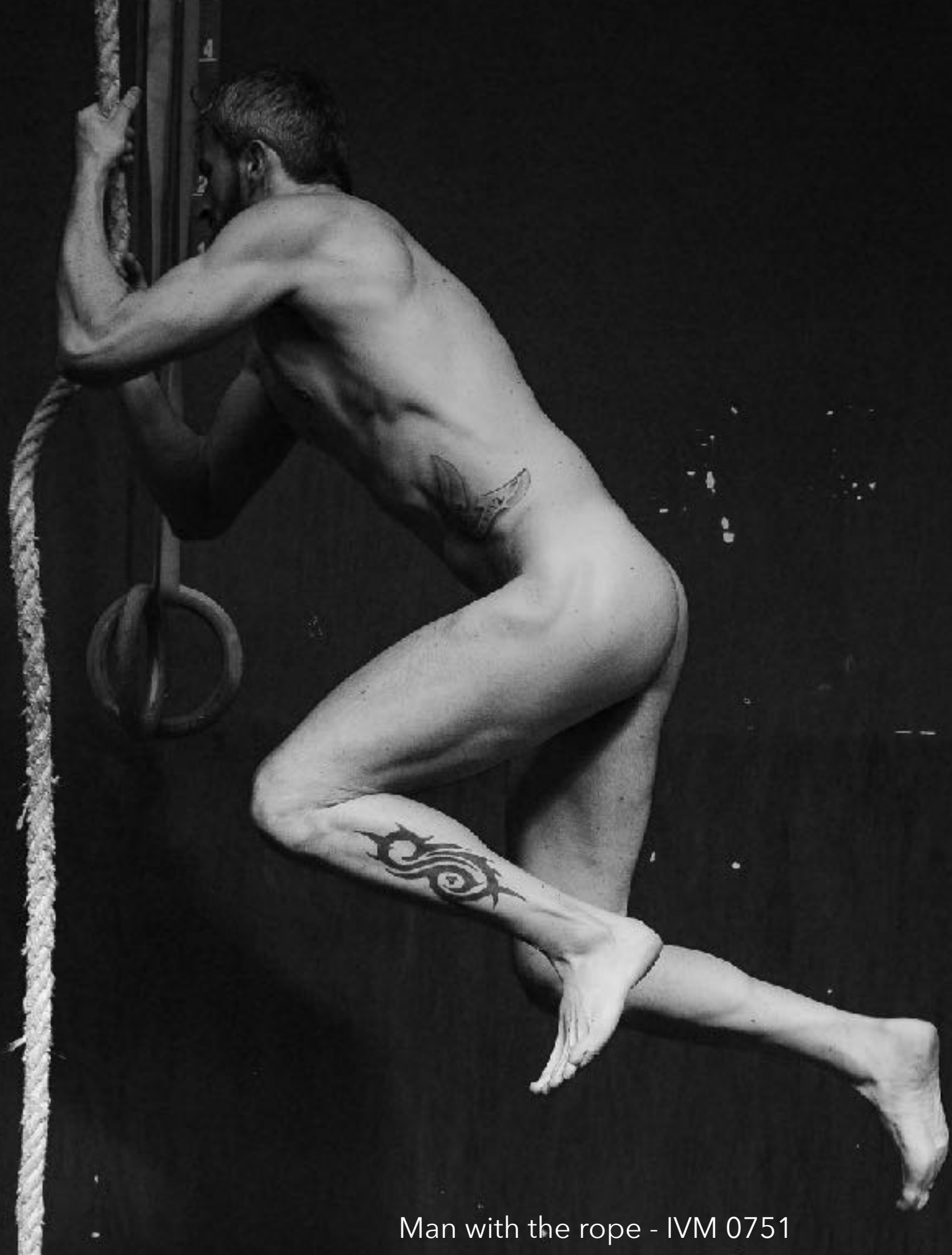
Man with the rope - IVM 0751