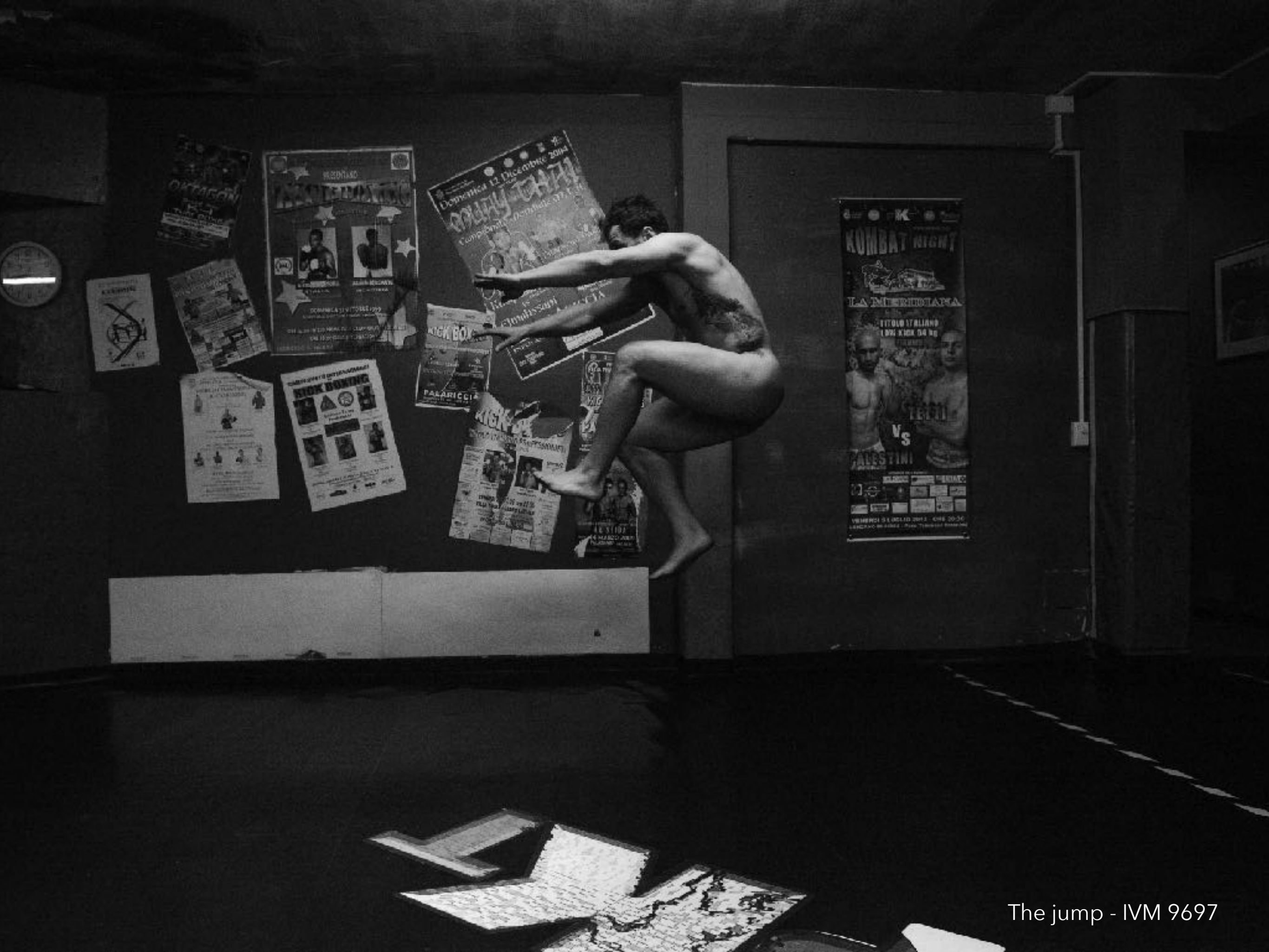
The jump - IVM 9697