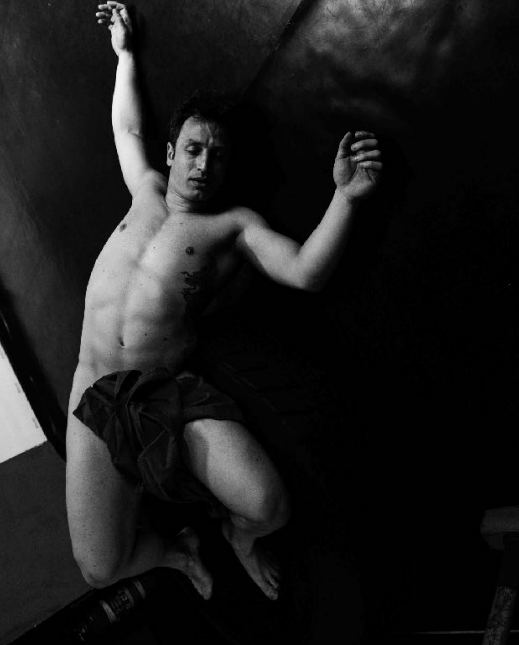
Sliding down - IVM 9865