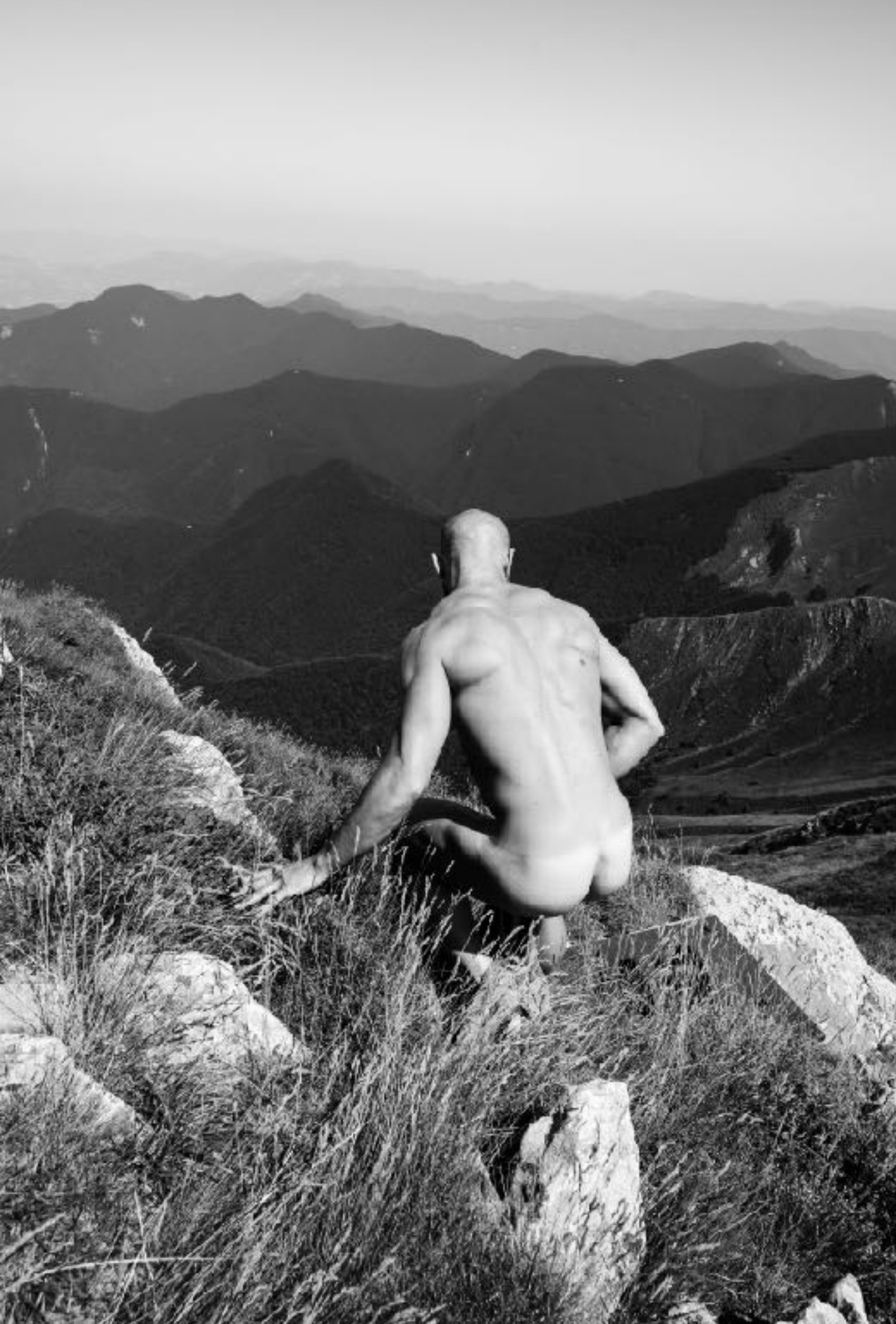
Naked on the mountains - IVM 4995