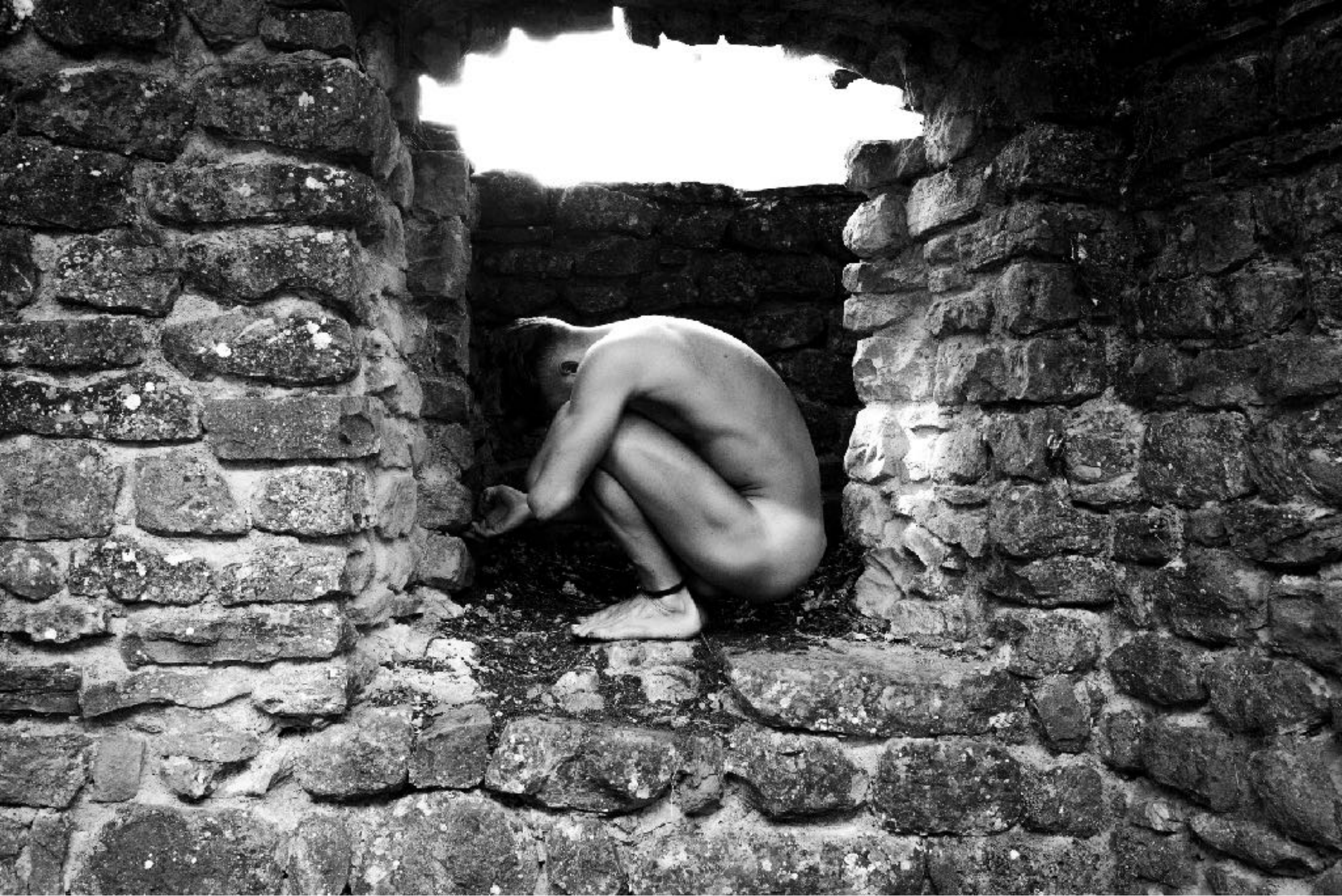
The thought and the unconscious - IVM 5634