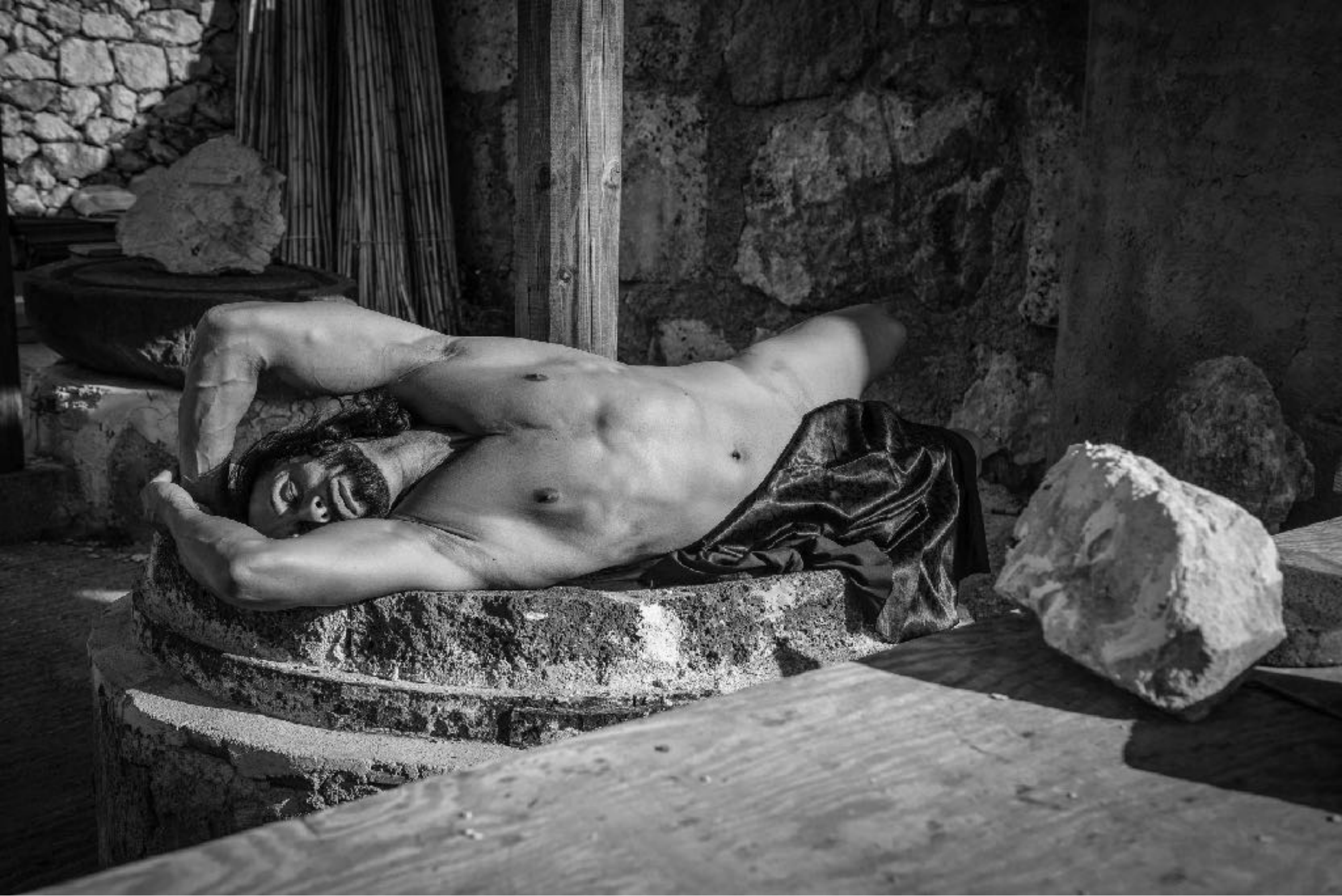
Sicilian in an ancient oil mill - IVM 4491