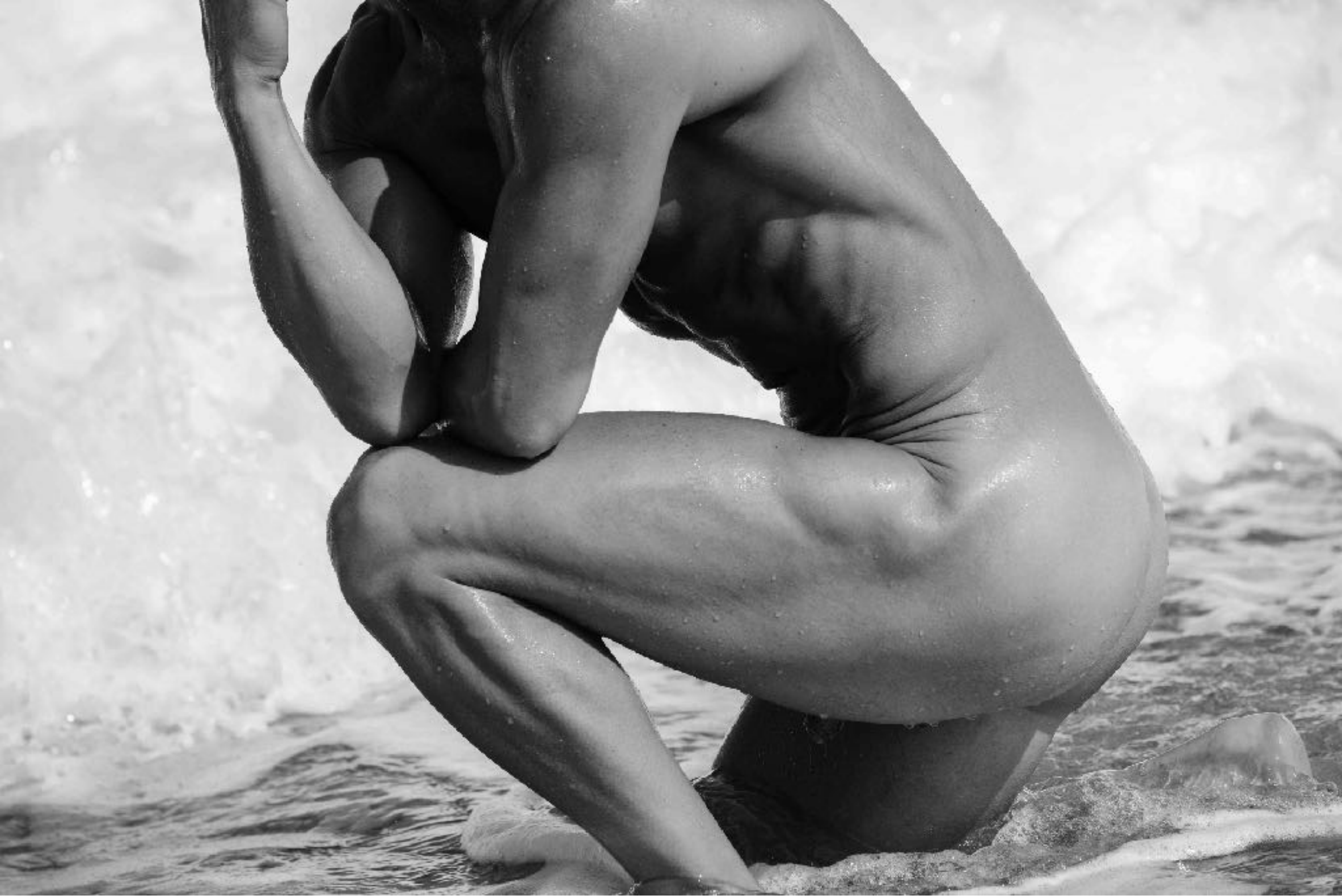
Waiting for the waves - IVM 2113