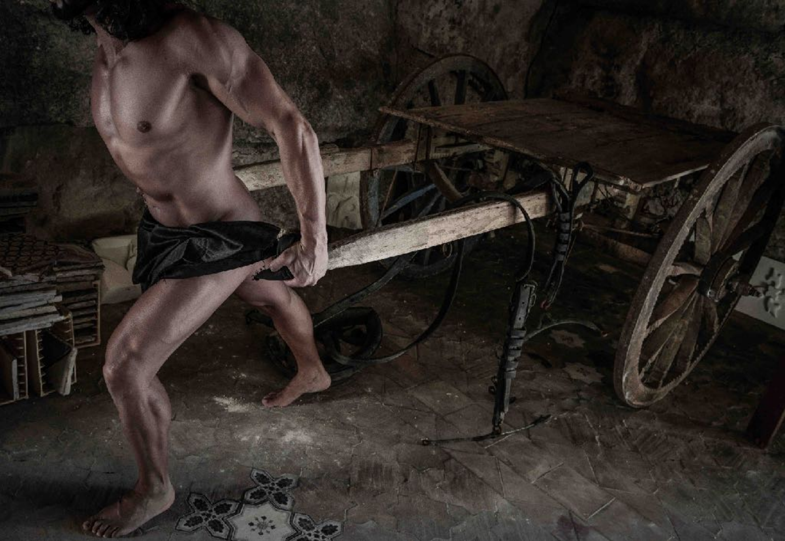
The Sicilian cart - IVM 4625