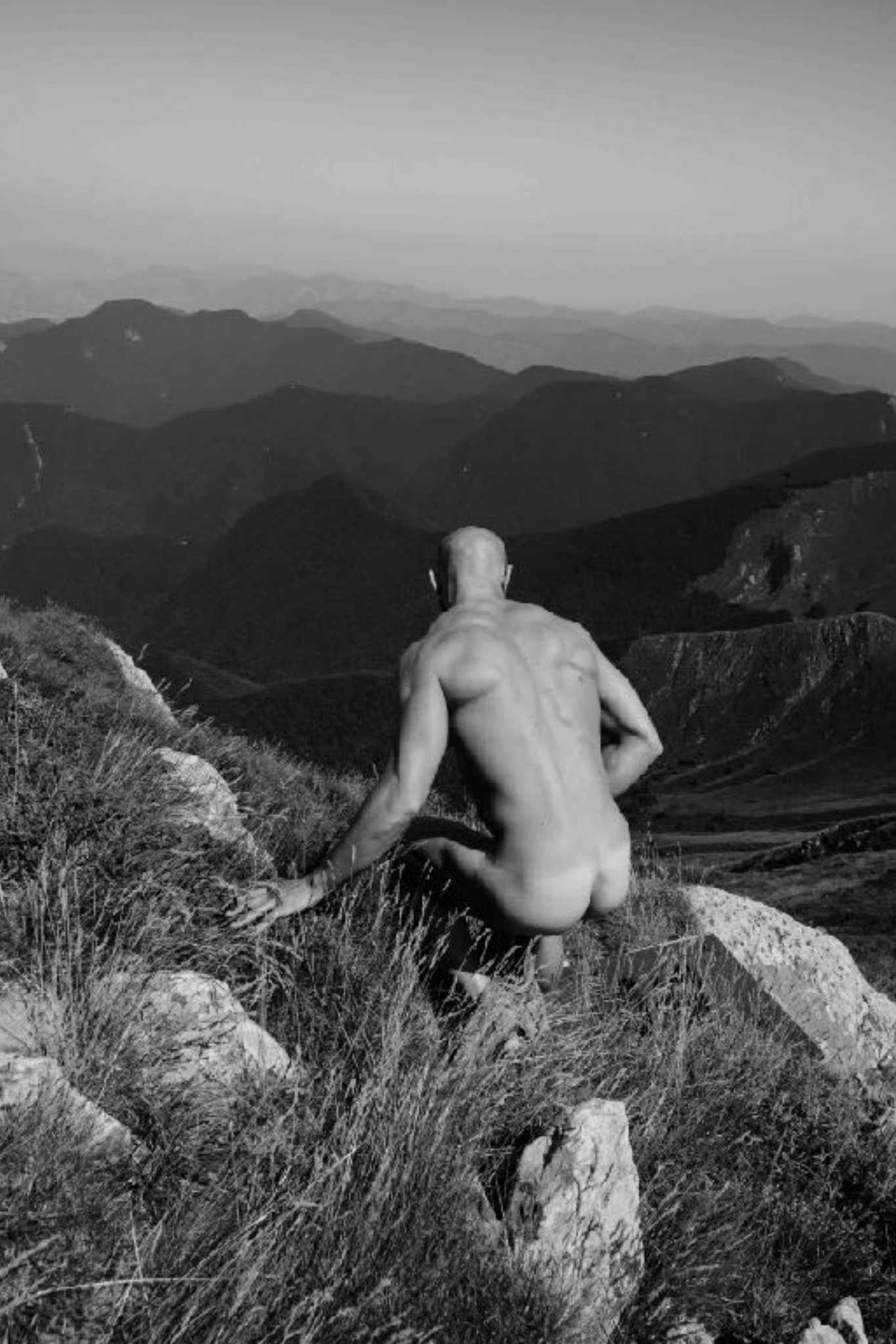
The jump - IVM 9697