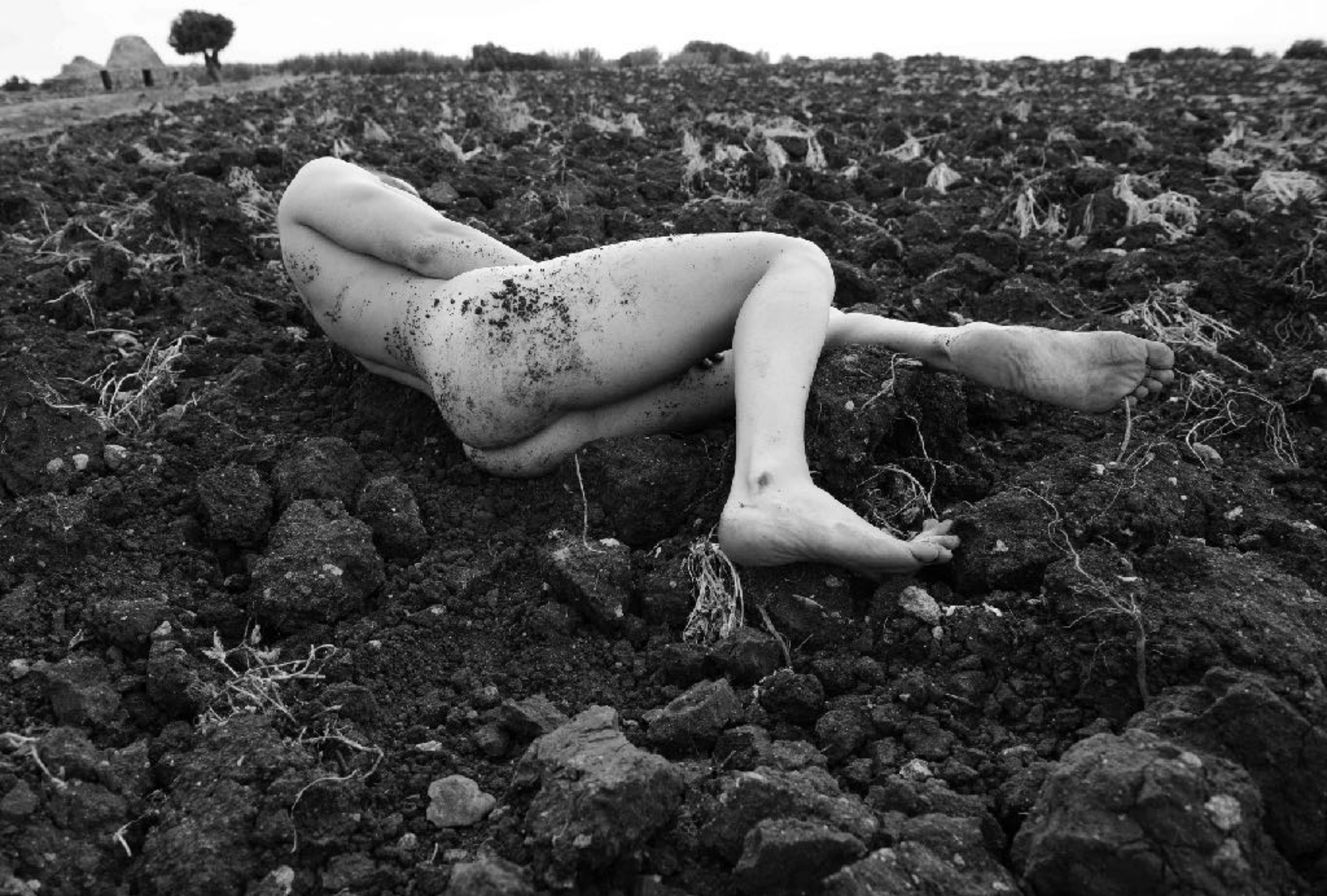
The Earth and the man - IVM 1850