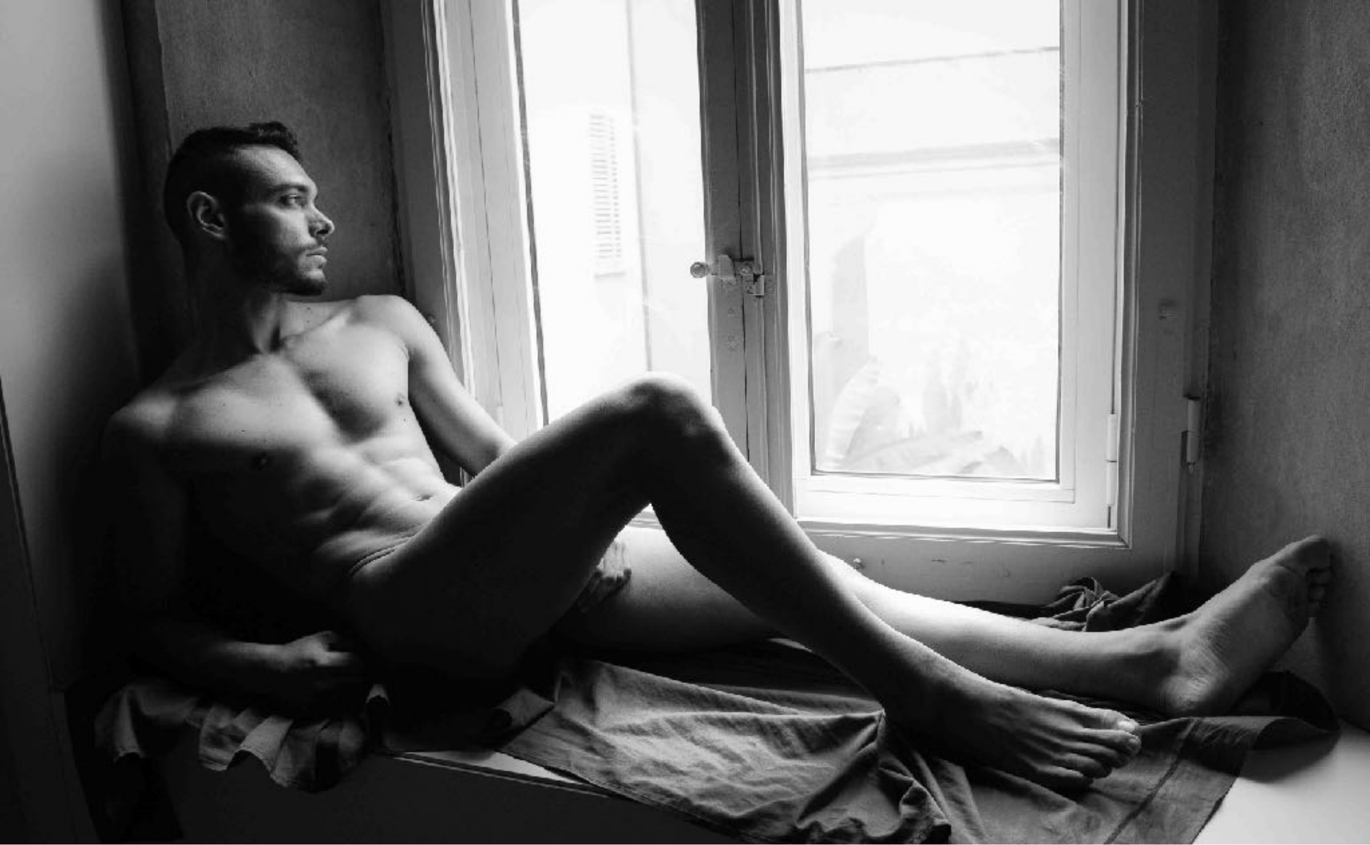
Calm light from the window - IVM 2538