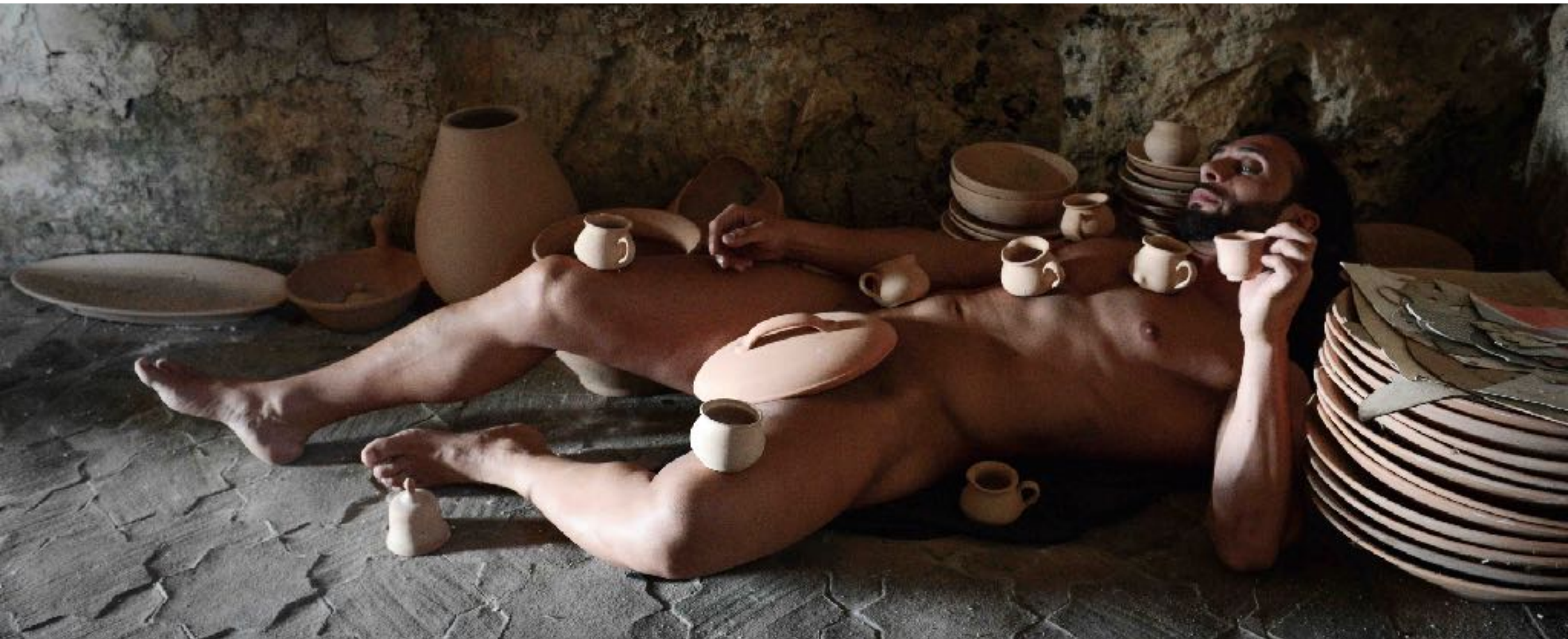
The terracotta cups - IVM 4676