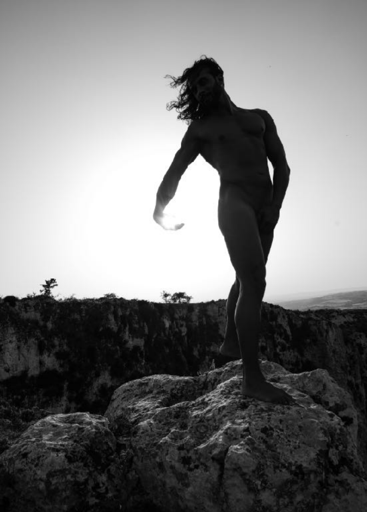
Backlight with the sun in the hand - IVM 4304