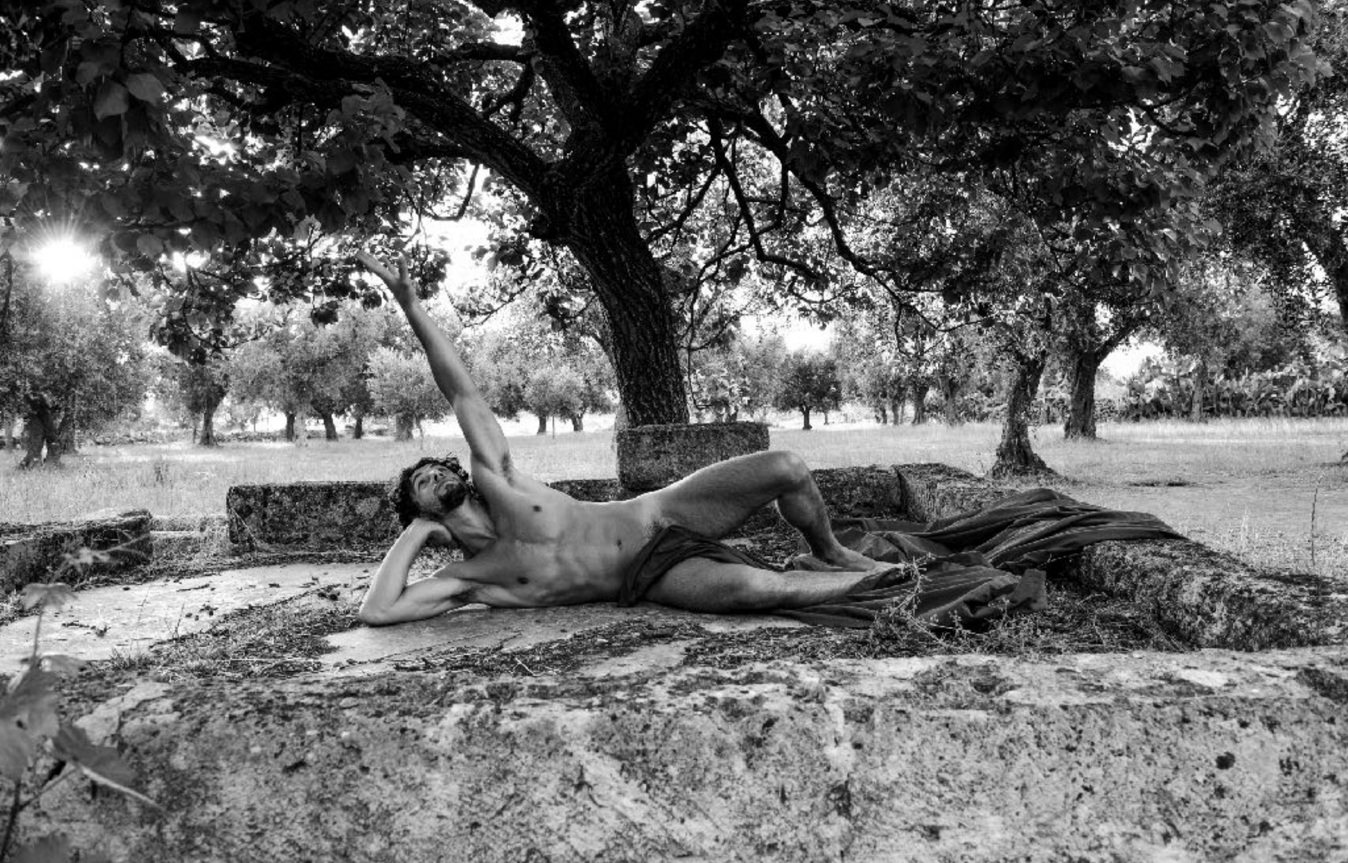
The request under the tree - IVM1202