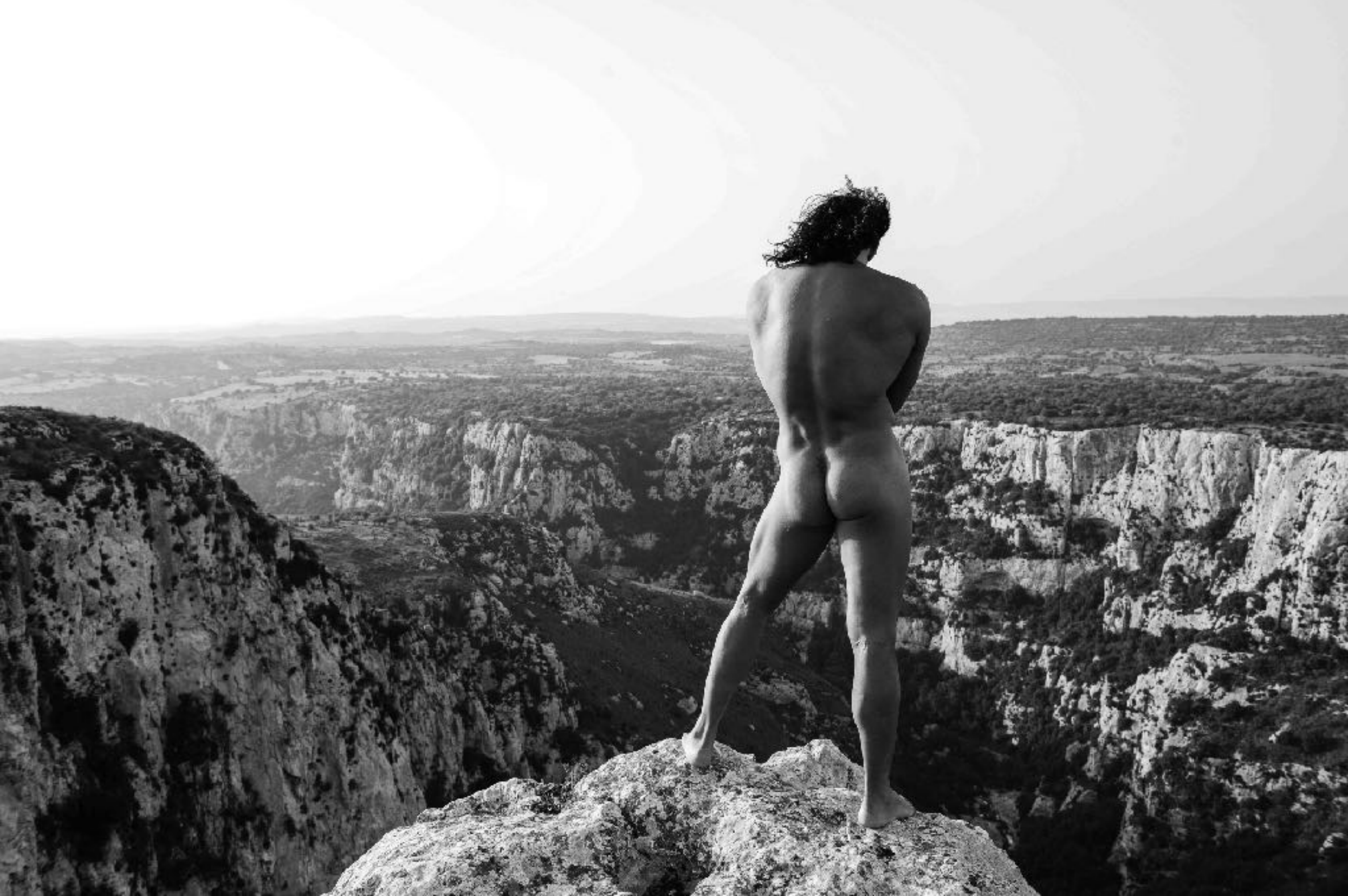
Himself with Nature -IVM 4288