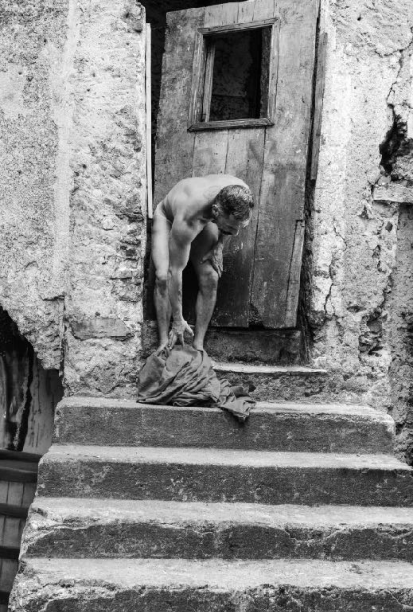
Calabrian man in the ruined village