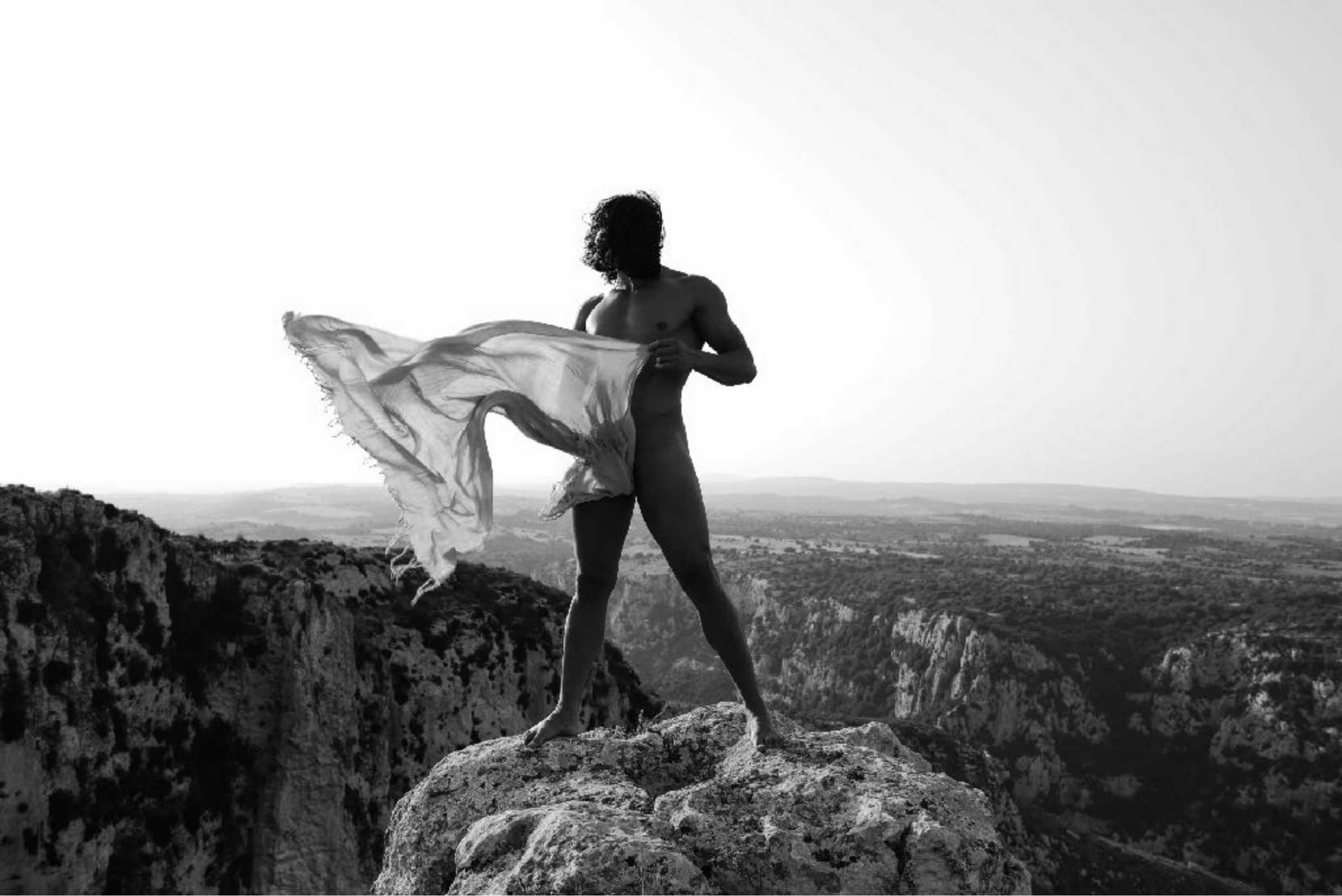
Sicilian man listens to the wind of the Iblei mountains - IVM 4211