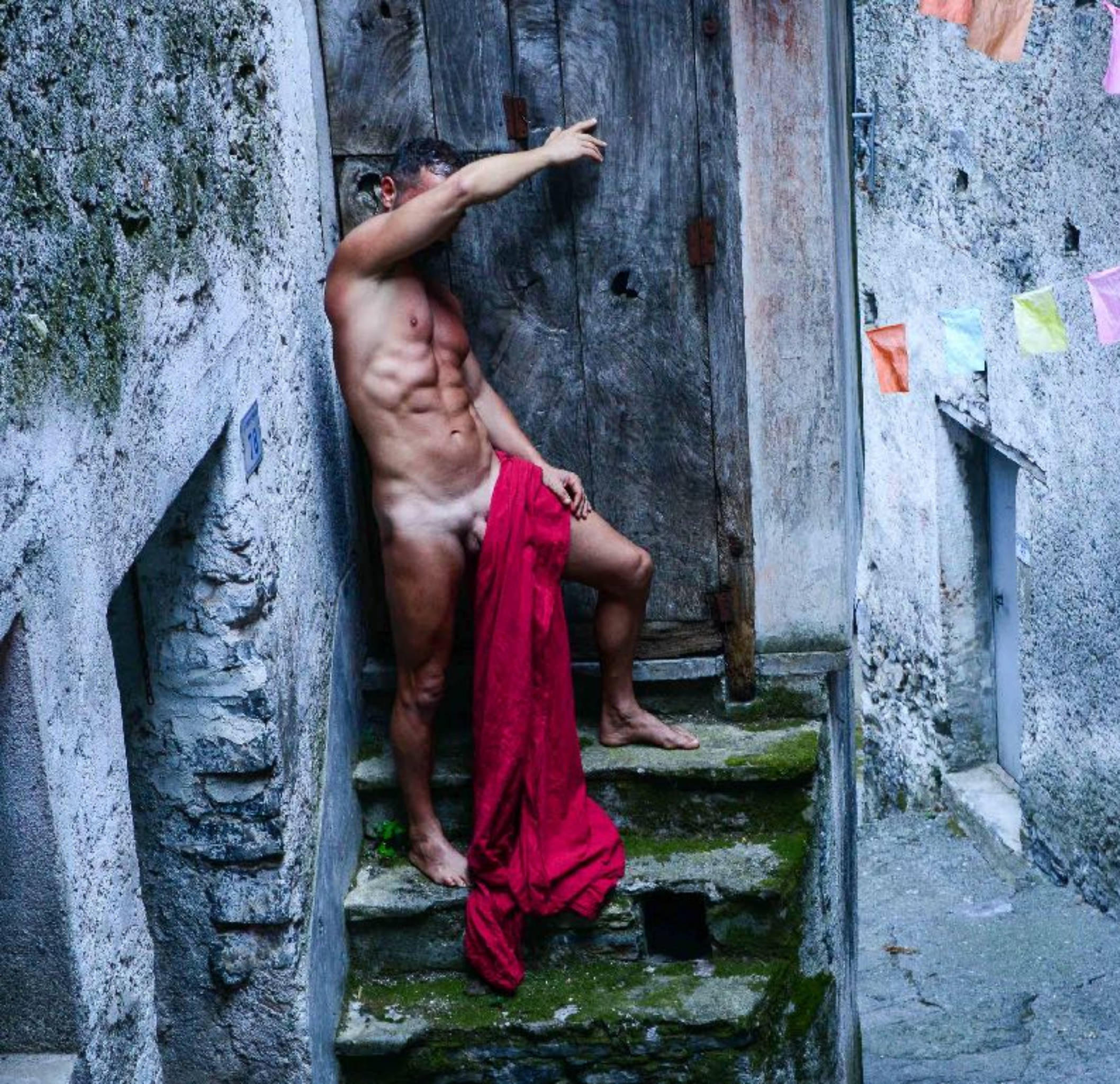
Calabrian naked in Verbicaro - IVM1068