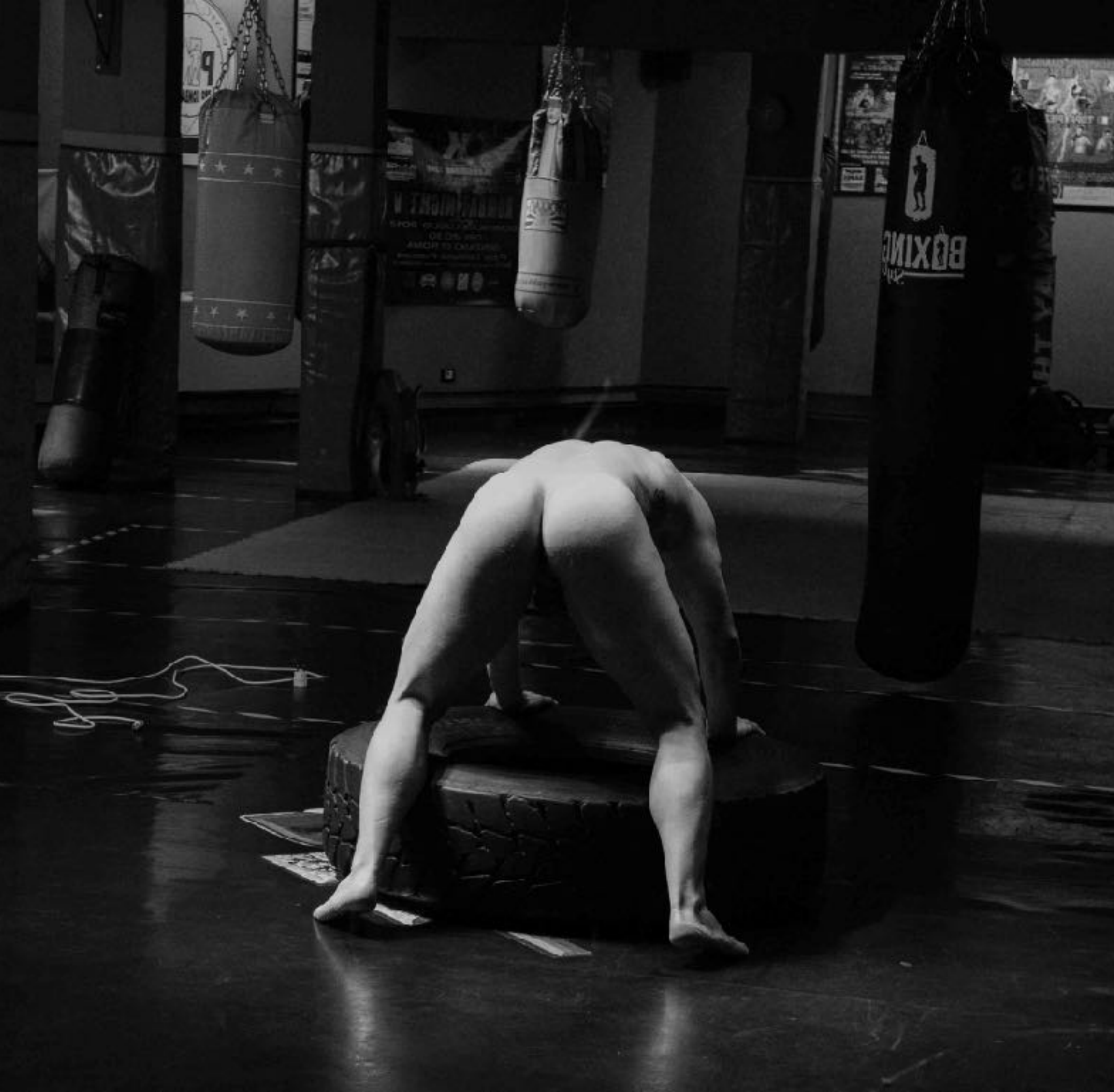
Wheel workout - IVM 9813