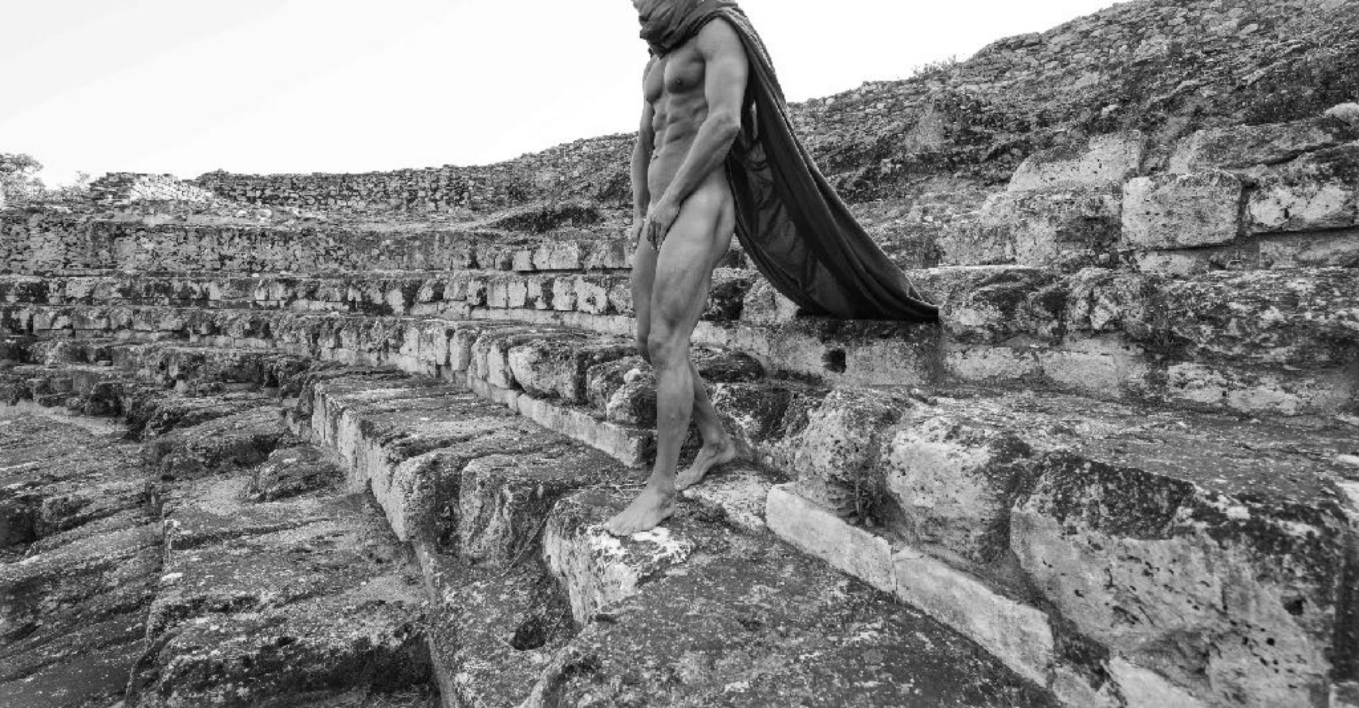
The naked King - IVM 2245