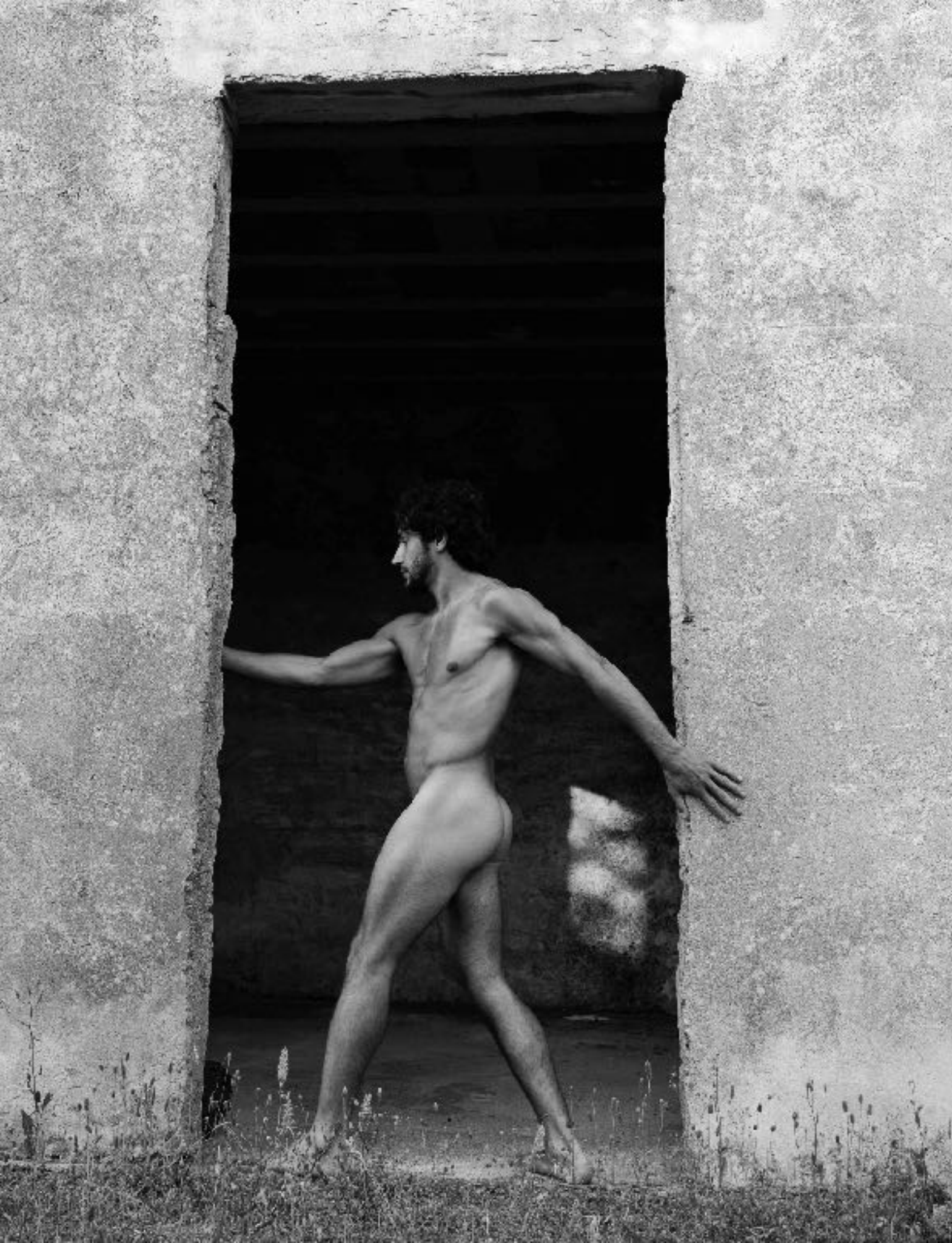
Naked and ancient entrance